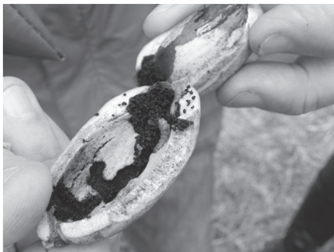
Fig. 2. Larva of Gymnandrosoma aurantianum and injury to pecan pericarp.

Gymnandrosoma aurantiana is known in Brazil as the citrus fruit borer, and became a key pest by the end of the 1980s, when larval injuries on fruits became serious damage, and compromised the use of fruits for industry or for consumption in natura, resulting in loss of production up to 50% (Prates 1992; Parra et al. 2004; Carvalho et al. 2015). This led to research efforts aimed at lowering losses, and basic studies on biology, rearing techniques, monitoring, and use of egg parasitoids, which resulted in parameters for G. aurantiana pest management, particularly in the state of São Paulo, the largest citrus producer in Brazil (García & Parra 1999; Vilela et al. 2001; Parra et al. 2004; Bento et al. 2006; Molina & Parra 2006). In Mexico, the egg parasitoid Trichogramma platneri Nagarkatti (Hymenoptera: Trichogrammatidae) was effective in pecan orchards when the abundance of tortricidae C. caryana was low or moderate (García-Nevárez & Tarango-Rivero 2013).