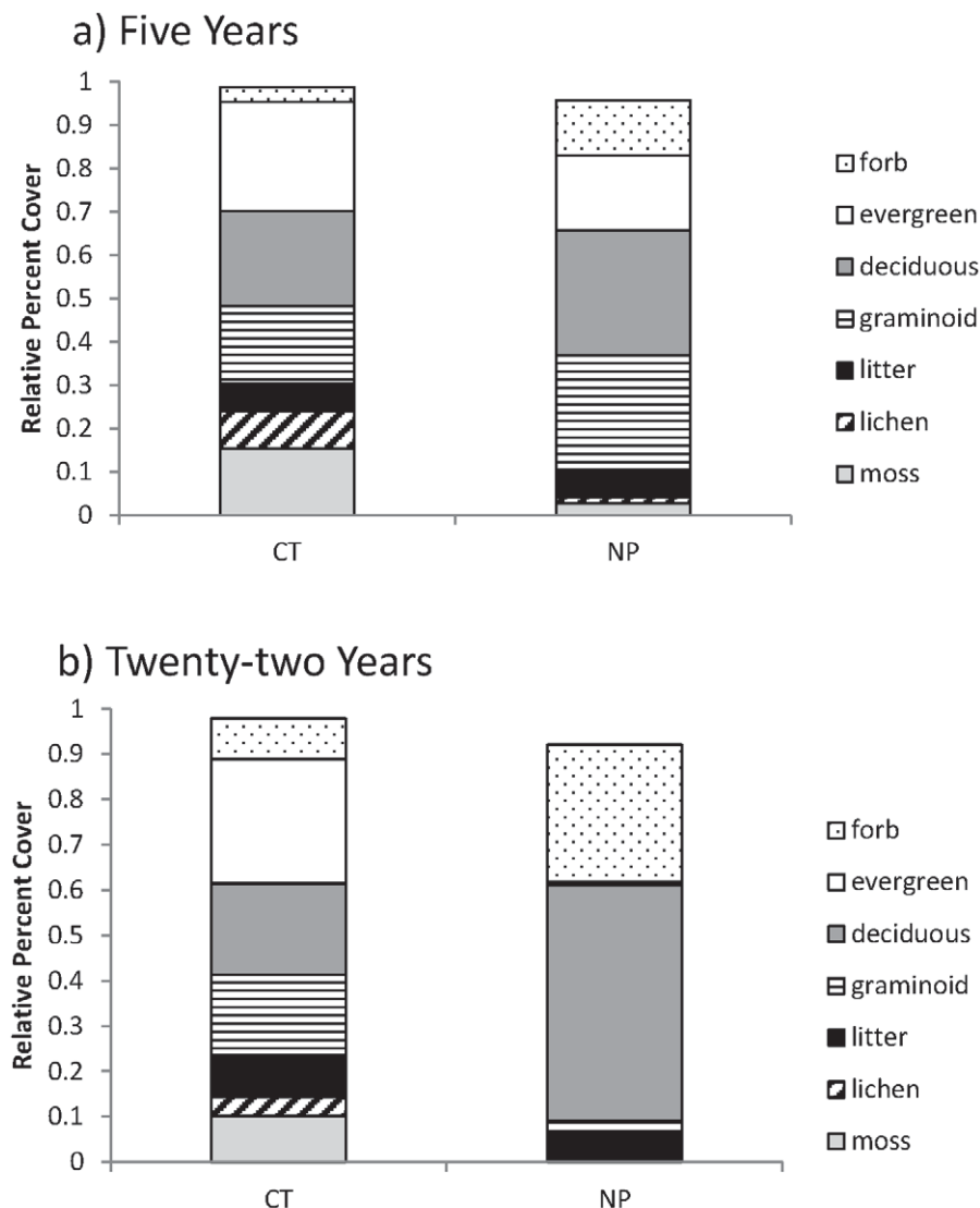
FIGURE 1. Relative abundance of plant growth forms in the plant community measured in moist acidic tundra in 2010 after (a) 5 years and (b) 22 years of treatment. Treatment abbreviations: CT = control, NP= nitrogen plus phosphorus added.

dispersed and thus unlikely to be detected using this seed rain method (Molau and Larsson, 2000). Only three Rubus seeds were collected, despite 5–6 berries m^{-2} counted in fertilized plots in both experiments (“Forbs” in Table 2), and these had been completely removed from the berry, broken open and had the center eaten out, rendering them unviable. Wind-dispersed Rhododendron seeds are very small and appeared relatively evenly dispersed across the study site, despite this species having less cover in fertilized plots. In contrast, dispersal of Betula was highly localized; the control and fertilized seed rain plots were within 50 m of each other, but the large numbers of Betula seeds were recorded only adjacent to the fertilized plots, suggesting that the seed rain input from increased abundance of Betula will be on a relatively small, local scale.