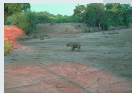
FIGURE 7 The regular drying up of the formerly perennial Ewaso Ng'iro River is affecting downstream populations, wildlife, and international tourism.

Researchers can make a significant contribution to such a multilevel strategy by providing findings to support continuous communication and learning processes. However, this requires that they also take part in learning processes and not overestimate the convincing power of stand-alone information. Researchers must thus take account of the fact that the key to solutions lies in continuous sociopolitical negotiations at different levels, in which research can play a crucial role in promoting greater awareness and more informed decision-making. This crucial role also implies that research will not just be limited to the initial stages of strategy development but must be incorporated by society and decision-makers on a continuous basis.