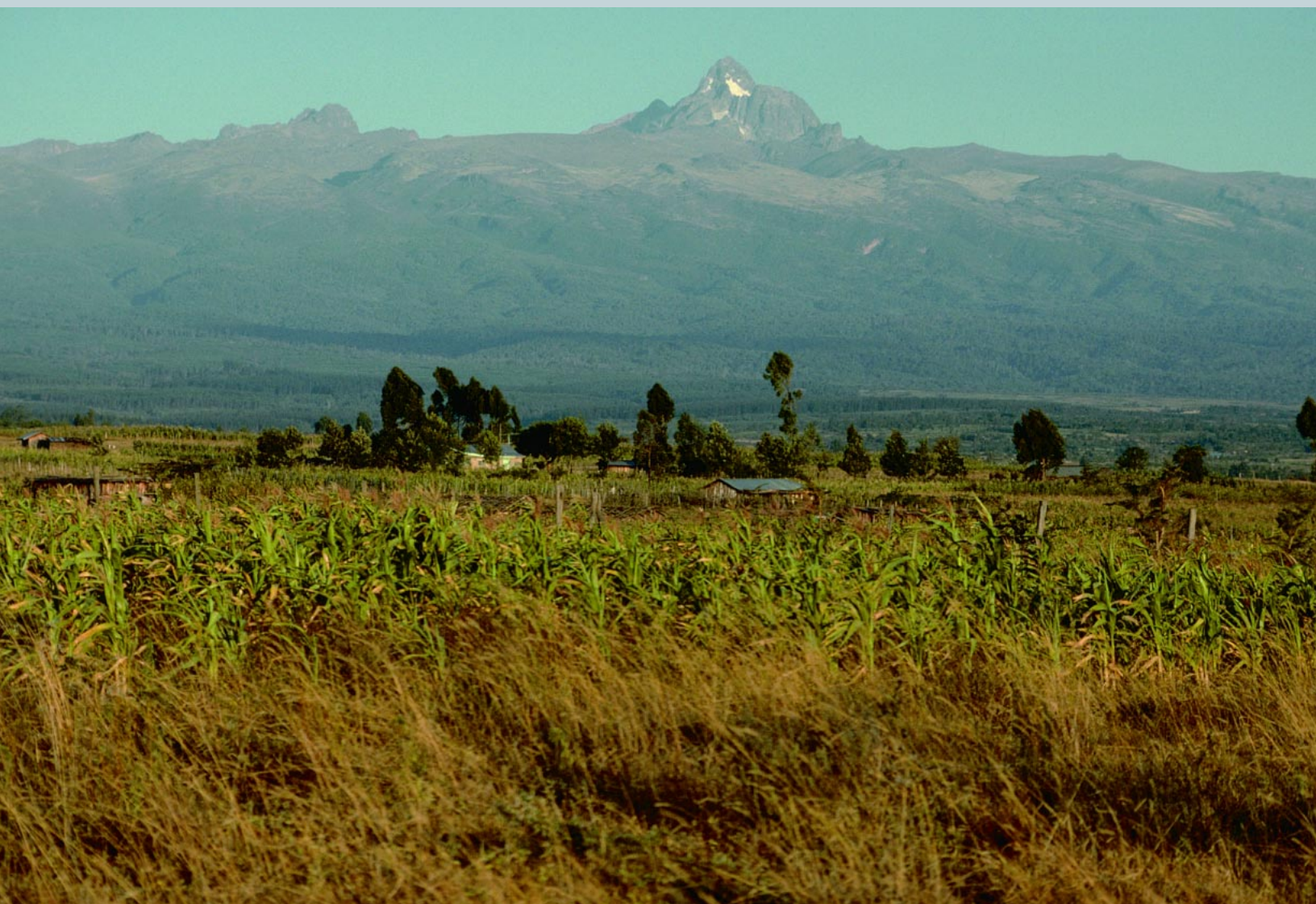
FIGURE 1 Mount Kenya, with its glaciers, moorlands, and rain forest belt, is the water tower of the Ewaso Ng'iro Basin.

over water resources; to make things worse, water is becoming ever scarcer, especially in the dry areas of the Laikipia Plateau and the Samburu Plains to the north and west of the mountain. This article summarizes the complex ecological and socioeconomic dynamics prevailing in the highland–lowland system of Mount Kenya—the Ewaso Ng'iro North Basin—and presents a multilevel strategy for mitigating the emerging conflicts over water resources.