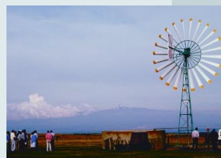
FIGURE 8 The establishment of a non-river-based water supply system in the upper reaches is part of a multilevel water strategy in the Ewaso Ng'iro Basin.