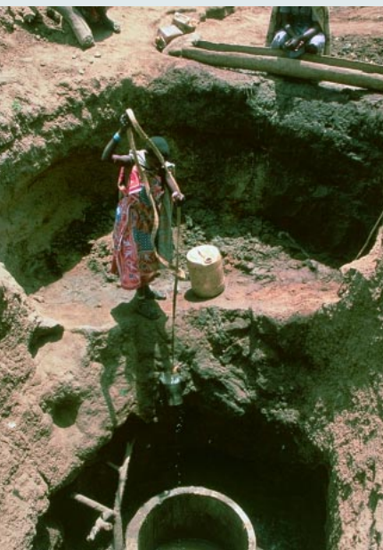
FIGURE 6 Due to overutilization of river water in the upper catchment, access to water has become the most limiting factor for downstream pastoralists.

"We are creating jobs for the people and income for the nation. We are doing that with the most advanced and efficient water use technologies. Hence, there is no reason to blame us for the water problems downstream." (Manager of a horticultural enterprise in the foot-zone of Mount Kenya)