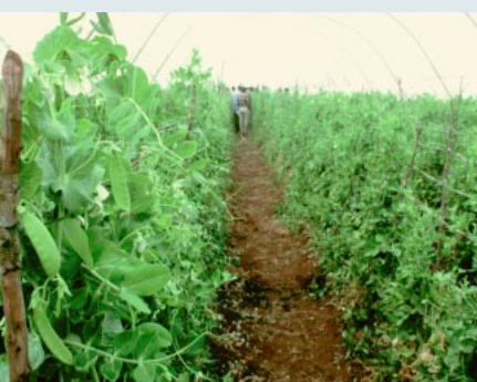
FIGURE 4 In the footzone of Mount Kenya, large-scale export-oriented horticultural enterprises have been established in recent years.

“Without water, no wildlife. Without wildlife, no tourists. And without tourists, no jobs down here and no foreign currency income for the government. It is as simple as that. Go and tell this to your people up there.” (Lodge Manager in the Samburu Park, lower reaches of the Ewaso Ng’iro Basin)