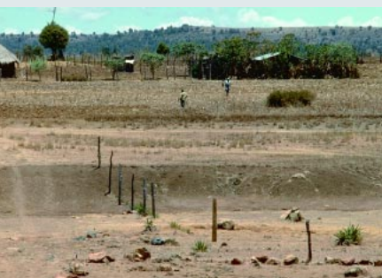
FIGURE 3 Smallholders who immigrated from high-potential areas are struggling to earn a livelihood in the semiarid conditions of the Laikipia Plateau.