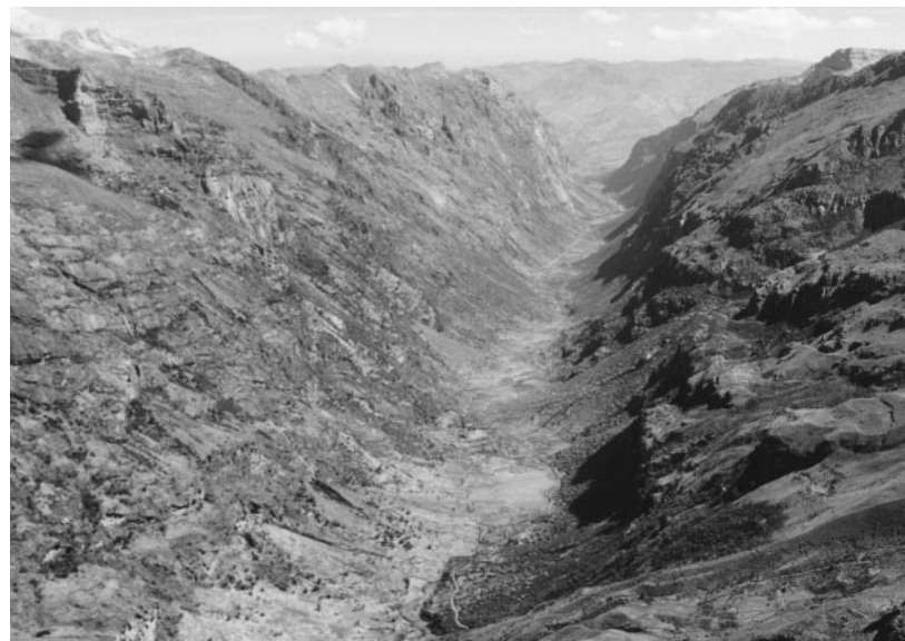
FIGURE 6 Q. Honda from Portachuelo (Byers, 7 July 1998)

zone, and large numbers of healthy Polylepis and Gynoxis seedlings and saplings were observed within the grasslands (also inaccessible to cattle) for up to 50 m from the forest edge. In contrast, high levels of cattle-