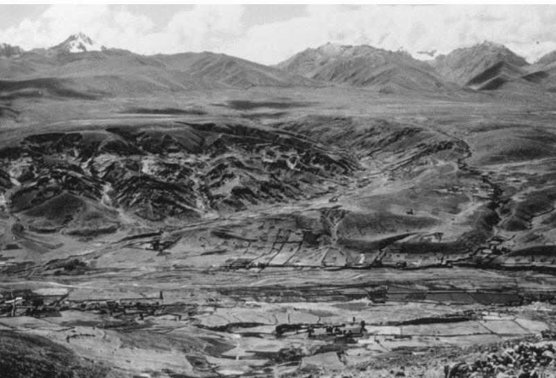
FIGURE 11 Ticapampa from the Cordillera Negra (Kinzl, 1936)