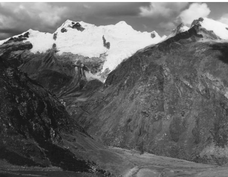
FIGURE 3 Yanapaccha (5460 m) from Pisco basecamp region (Schneider, 1939)