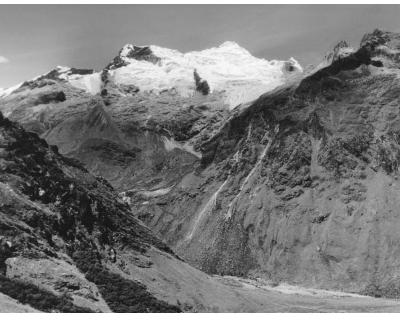
FIGURE 4 Yanapaccha (5460 m) from Pisco basecamp region (Byers, 8 September 1997)

vate collections in Huaraz, the latter of which will ultimately permit further chronological analyses of landscape change phenomena for the years 1932, 1936, 1939, 1954, 1980, 1986, and 1994 (Ames, personal communication).