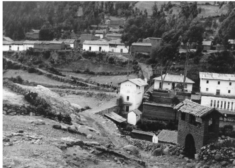
FIGURE 9 Olleros village (Kinzl, 1936)

Larger-scale photographs of village scenes can show a significant amount of detail related to contemporary changes in the cultural landscape, perhaps most dramatically evident when viewed in terms of the impacts of catastrophic events and changes in forest cover. In partial illustration, the village of Olleros, south of Huaraz, is shown in a 1936 Leica photograph taken by Hans Kinzl (Figure 9), with the 1997 replicate shown as Figure 10 (11 September 1997, 4:00 PM; focal