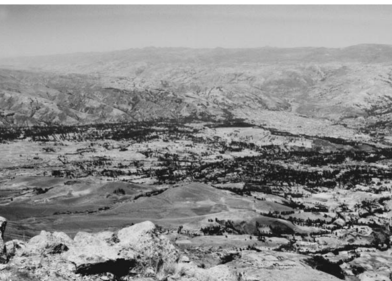
FIGURE 8 Huaraz from San Cristóbal (Byers, 10 September 1997)

induced seedling mortality were observed within the nonprotected and grazed areas at lower elevations within the valley.