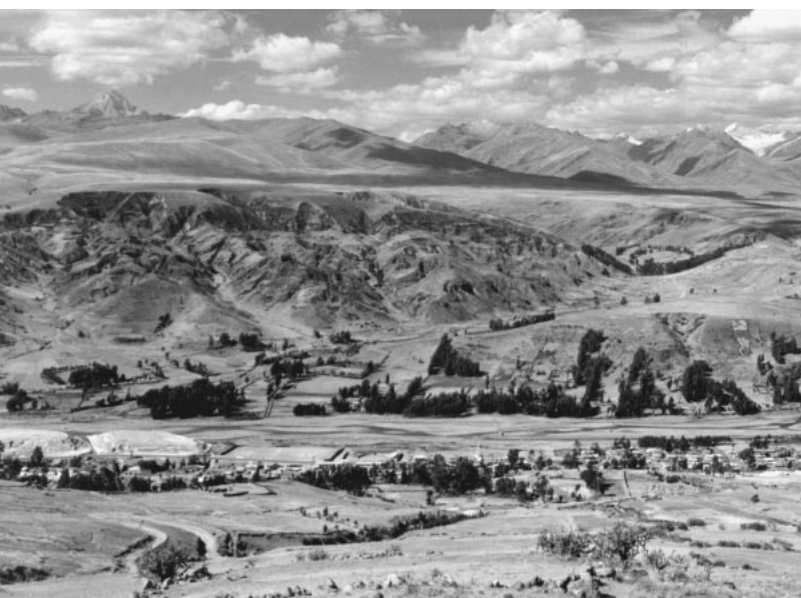
FIGURE 12 Ticapampa from the Cordillera Negra (Byers, 6 July 1998)

tion of mineral water; the spring is still active today and is protected by the small box-like structure shown in the 1997 photograph. The remaining white building with the lattice-type windows to the extreme right of center was most likely dismantled at some point well before the 1970 earthquake, as none of the informants could recall its presence prior to that time.