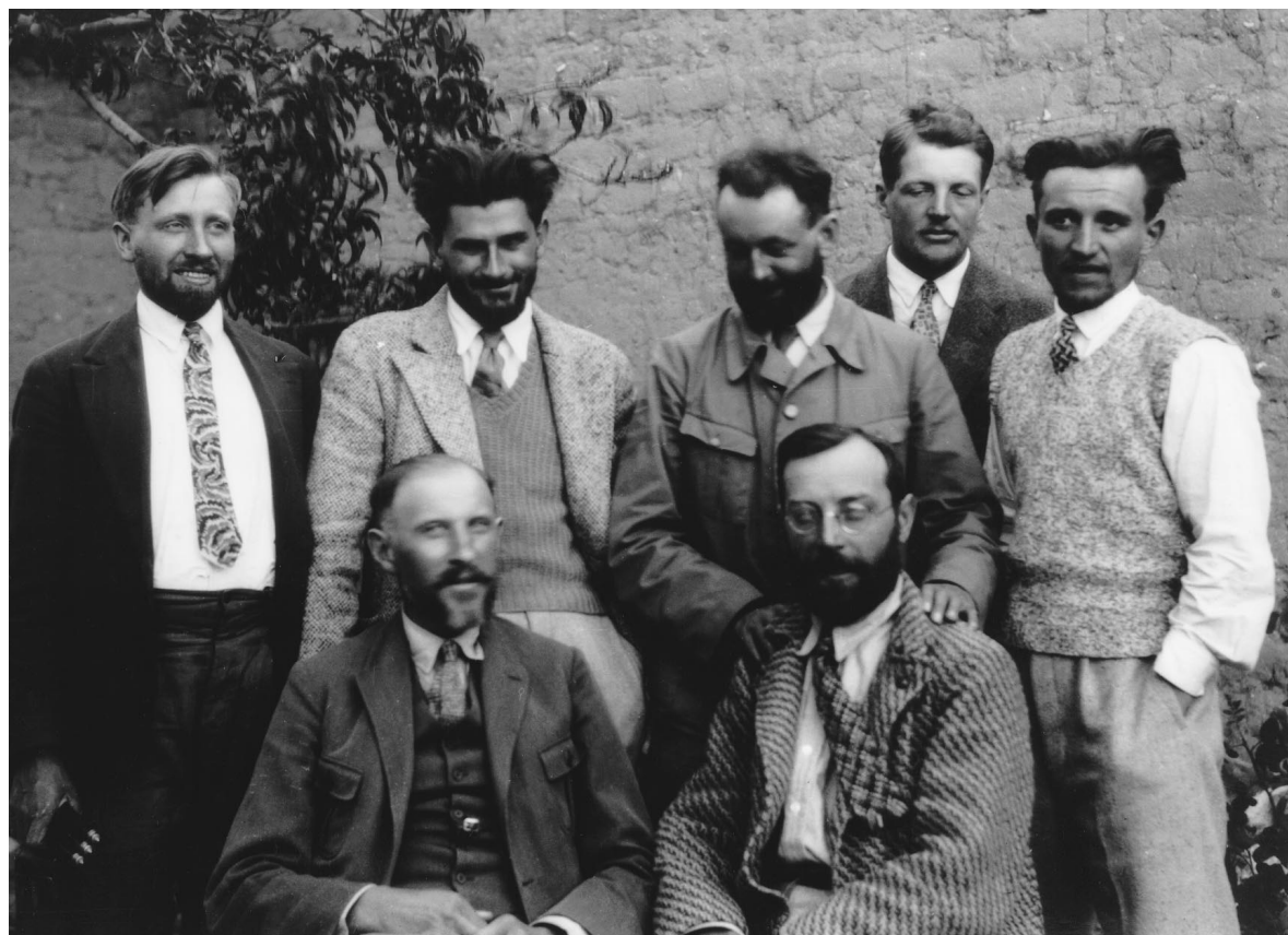
FIGURE 2 1932 German and Austrian Alpine Club expedition members.

Reserve in 1977, and a World Natural Heritage Site in 1985. The park contains 60 peaks with altitudes surpassing 5700 m, the highest being Huascarán at 6768 m. Forty-four deep glacial valleys transect the range from both west and east and, when combined with the extensive Peruvian mountain road system, provide relatively easy access for hikers, climbers, and the livestock of traditional cattle herders. Most of the terrain below 4800 m is characterized by high altitude grassland ( puna ) with remnant quenual ( Polylepis sp) forests located within the upper, inner valley slopes. Although thought to have been greatly reduced during the past century (Fjeldså and Kessler 1996), the Polylepis forests contain a diversity of flora and fauna within the park while providing habitat for many species of endemic Andean birds. Approximately 779 plant, 112 bird, and 10 mammal species have been recorded for the region (Smith 1988; Brako and Zarucchi 1993; The Mountain Institute 1996; Kolff and Kolff 1997).