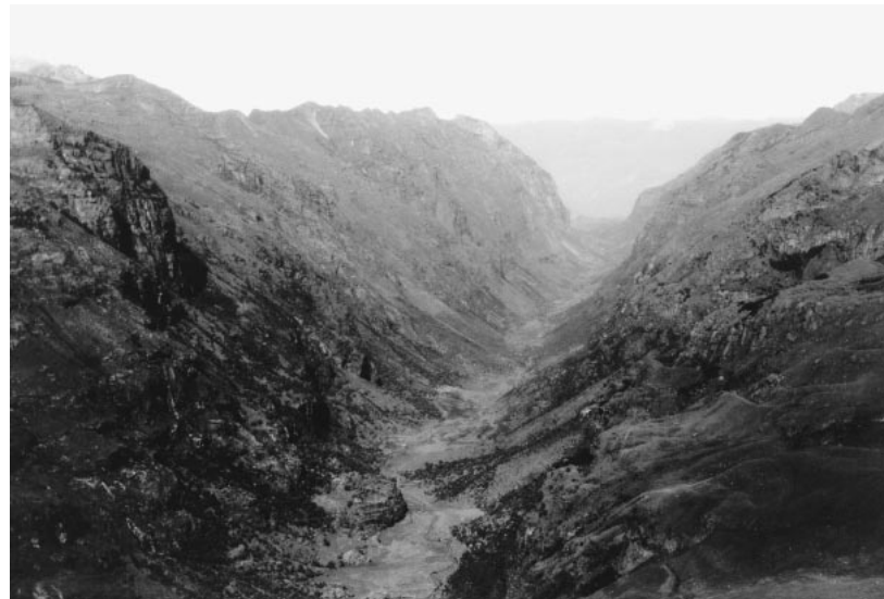
FIGURE 5 Q. Honda from Portachuelo (Kinzl, 1932)

Park authorities suggest that preservation of this particular forest in the Pisco valley is the result of management interventions imposed since 1975 (Valencia, personal communication), and recent efforts to re-establish Polylepis along trails and hillslopes were observed. Ground-truth examination within the forests, however, shows that they are located on ancient blockfields, which, by all appearances, are and have been for centuries inaccessible to cattle. The results from a 400-m 2 sampling plot (Table 1) show that natural regeneration processes are high within the forest