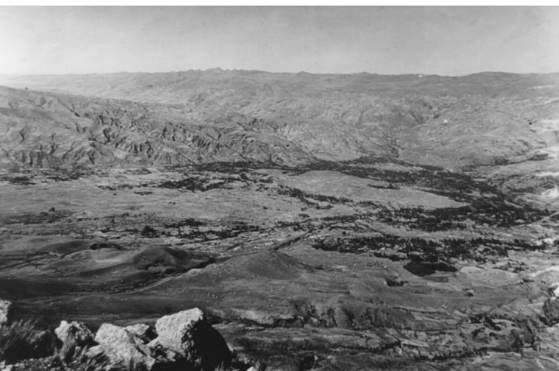
FIGURE 7 Huaraz from San Cristóbal (Schneider, 1939)