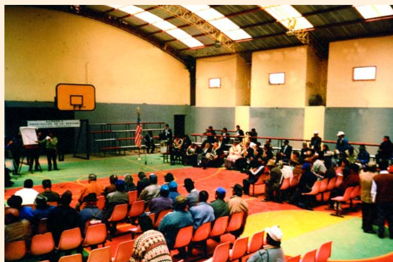
FIGURE 3 Participatory planning in Pucarani is directed by the president of the Monitoring Committee.

Pucarani is organized into rural communities and divided into major and minor agricultural syndicates; original indigenous Andean forms of organization have been lost. The syndicate form of