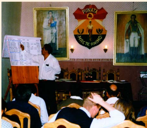
FIGURE 2 The president of the Monitoring Committee ( Comité de Vigilancia ) in Pumata explains how to undertake social monitoring of resources for public participation.

equal rights and duties regardless of size. They are granted competence in specific areas and full authority (arising from election by universal suffrage) to execute this competence. Two smooth elections have been held since the LPP came into force.