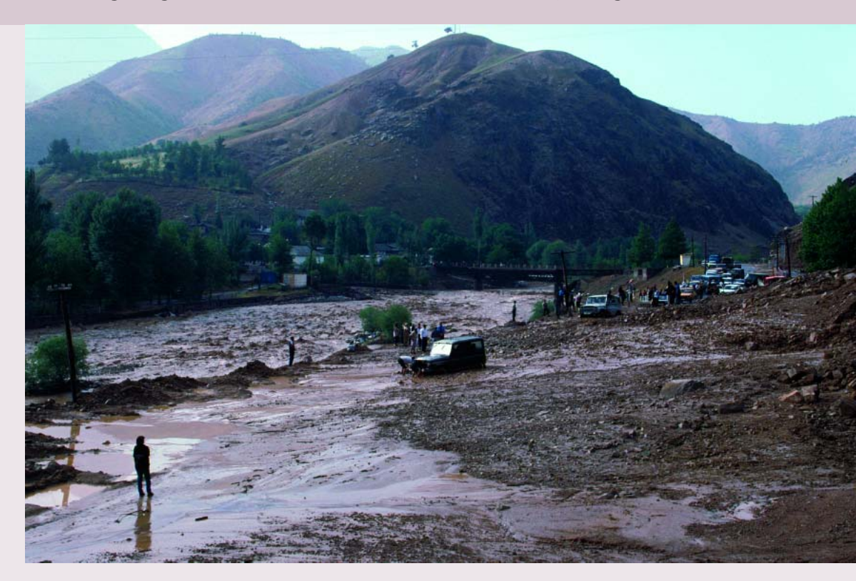
FIGURE 1 A hailstorm event in May 2001 in the deforested and overgrazed Varzob Valley in Tajikistan caused a catastrophic flood and a landslide that covered a road along the river. Three villages were destroyed and 1 person died. Events such as this illustrate the need for SWC measures to reduce direct runoff and soil erosion.

At the same time, there have been many achievements in sustainable land use and in avoiding and combating degradation (Figure 2). Every day land users and soil and water conservation (SWC) specialists evaluate experience and generate know-how related to land management, improvement of soil fertility, and protection of soil resources. Most of this valuable knowledge, however, is not well documented or easily accessible, and comparison of different types of experience is difficult. The World Overview of Conservation Approaches and Technologies (WOCAT) has the mission of providing tools that allow SWC specialists to share their valuable knowledge in soil and water management, assist them in their search for appropriate SWC technologies and approaches, and support them in making decisions in the field and at the planning level.