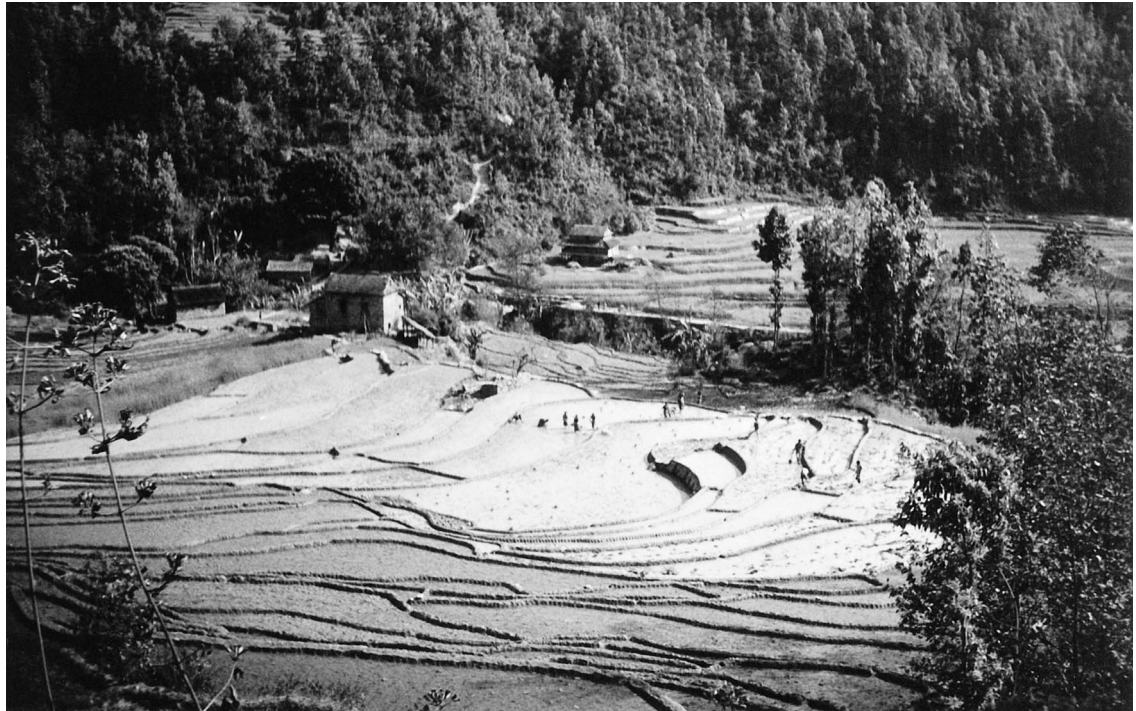
FIGURE 4 Rice transplanting on khet terraces low down on the valley side. Remnants of sal woodland in the background, in various states of degradation.

the main monsoon. Thus, these terraces are subjected to continued irrigation for a long period of time. Single-irrigated khet land is subject to natural climatic conditions during the premonsoon period and to artificial irrigation during the monsoon season.