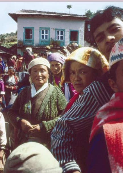
FIGURE 1 Enhancing the status of women requires more than focusing on women's roles in society. The entire social context must be analyzed to determine the need for measures to promote equality of opportunity.

“Development without women is like a bird trying to take off with only one wing,” according to Abeba Habtorm, director of the Ministry of Education in Asmara, Eritrea. Are mountain women adequately integrated in development cooperation efforts internationally, by region, nationally, and in local communities? Has the vital role of women in sustainable development of mountain communities been sufficiently documented, understood, and especially taken into account in development projects? Mountain women's concerns have been the subject of debate during the last 3 decades, and some efforts have been made to develop more gender-sensitive policies and programs as well