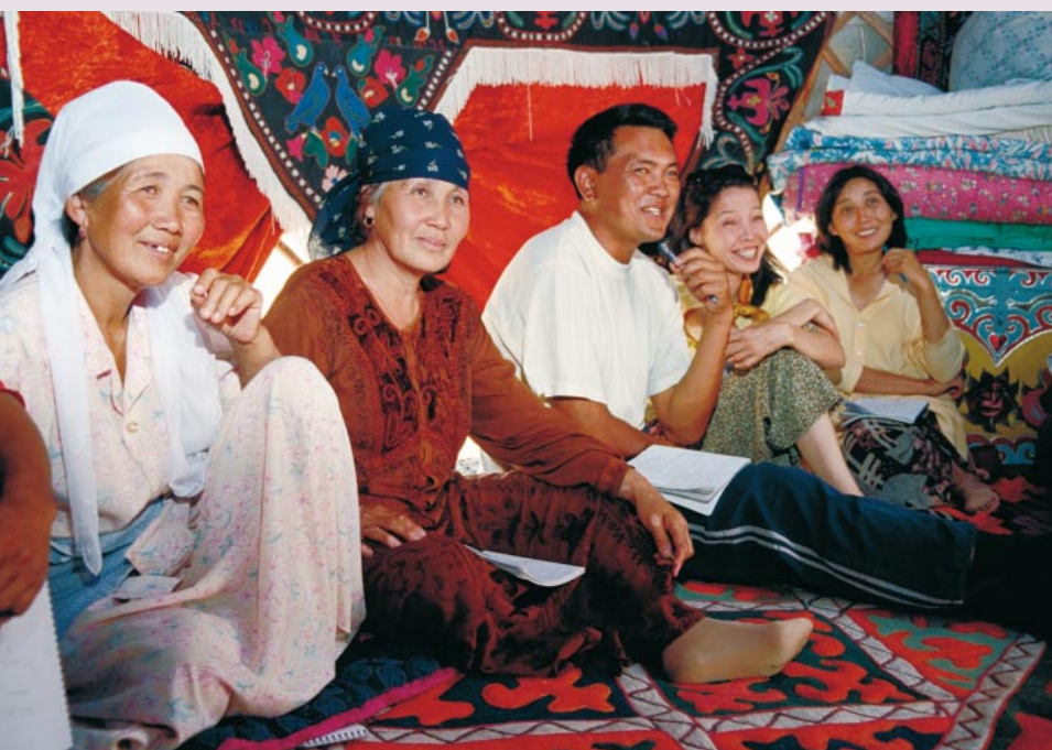
FIGURE 2 Participants at a workshop on Autodidactic Learning for Sustainability (ALS) in Ak Bosogo, Kyrgyzstan. The ALS approach has proven to be one successful way of achieving sustainable development because it enables women and men to formulate their own vision of development together.

great wealth of indigenous knowledge, especially regarding the management of natural resources. Failure to recognize the gendered nature of knowledge and integrate women in development processes means losing half this knowledge.