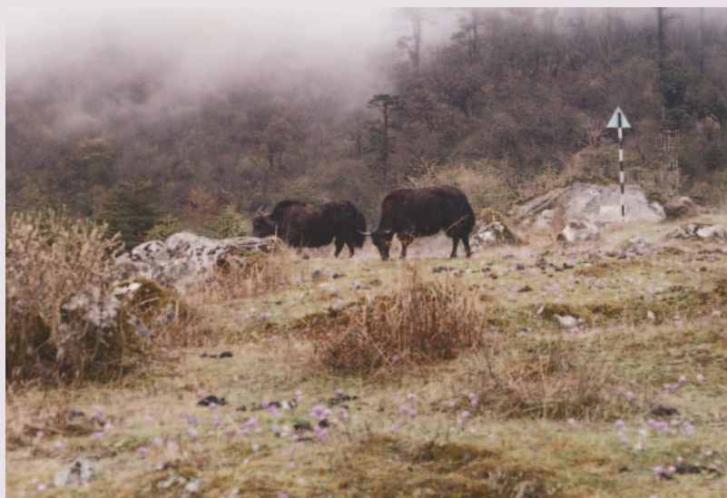
FIGURE 3 Yaks grazing on the alpine pastures in the buffer zones of the KBR.

tions under which annual income per household ranged from US$685 to US$1657 and literacy from 30% to 98%, with predominantly school-level education. The practice of livestock rearing to supplement agriculture and generate direct income is quite prevalent. Open grazing (eg, yaks grazing on alpine pastures, see Figure 3) is practiced for the most part, with limited stall feeding. The use of NTFPs and medicinal herbs is a common form of supplementary income.