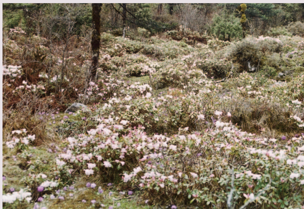
FIGURE 2 Rhododendrons found in the high-altitude zones showing the effect of habitat degradation.

In the last 10 years the population of Sikkim has increased by approximately 33%, thus putting even more pressure on resources. In the fringe areas, livelihood options such as traditional farming, pastoralism, and tourism exist. Agriculture is at the subsistence level, with dependency on natural resources in the surrounding forest exceeding 60%. Fringe areas were characterized by socioeconomic condi-