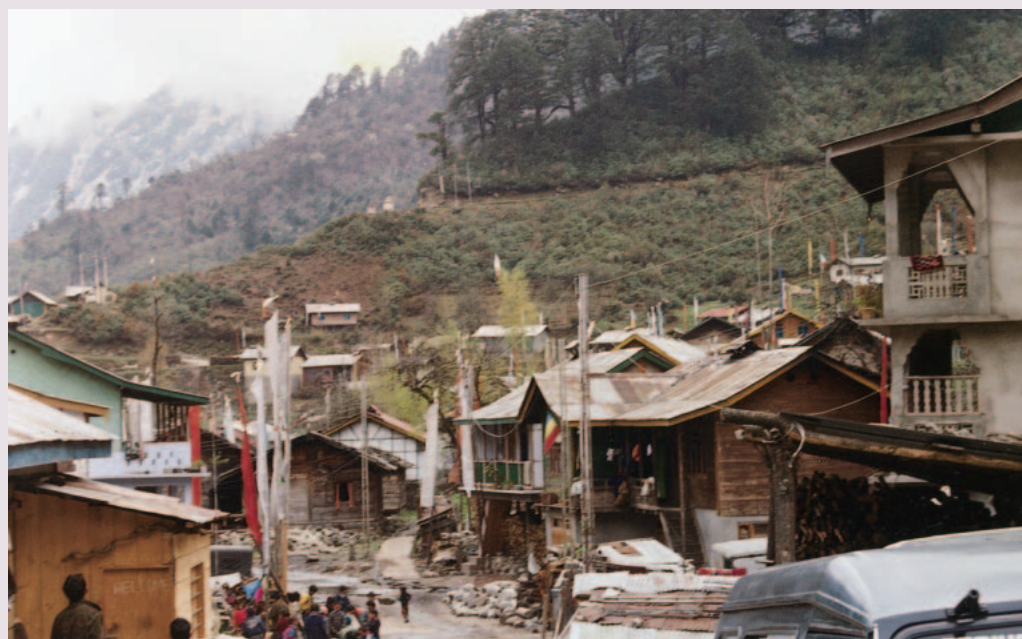
FIGURE 4 A high-altitude permanent fringe area settlement near the KBR.

Hence, conflicts are likely to crop up only when the real pressure of conservation restrictions begins to affect socioeconomic conditions and the traditional practices of people living in fringe area settle-