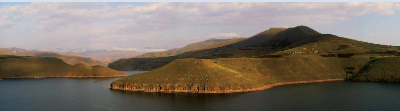
FIGURE 3 The vast extent of the Katse Dam is a mixed blessing for Lesotho: agropastoral communities have had to resettle at higher altitudes (see houses high on the slope). They have lost land, and water now divides them. But the dam has also brought great economic development to the country.

“We are poorer than before.” (Malehana Motanyane, 70-year-old villager)