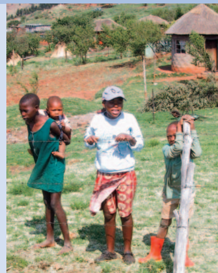
FIGURES 1 AND 2 Above: members of a community displaced and resettled as a result of dam construction in Lesotho. (Photo by Urs Wiesmann). Below: endangered spiral aloe ( Aloe polyphylla ) confined to mountains in Lesotho. (Photo courtesy of the International Rivers Network)

On a more positive note, much has changed for the better since the project began. The villagers have now organized themselves into small agricultural groups and produce cash crops. Good roads have greatly helped in bringing vegetables and other crops to market. The village group has now been together for more than 3 years. With the help of the Rural Empow-