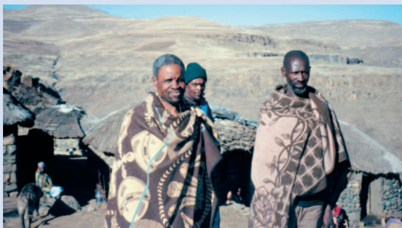
FIGURE 4 These men from the village of Ha Theko have lost communal assets, like many other people among the 30,000 affected by the construction of the dam.