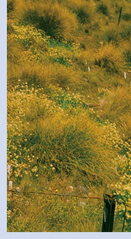
FIGURE 2 Snow-tussock grassland at 1120 m that has been oversown and topdressed as a warm-facing part of the block or tract of grazing land used for ewes and their lambs in spring and summer on Longslip Station in Ahuriri district. Annual precipitation: 800 mm.

Under the name of a "soil conservation program," mind-sharing, practical consultation between the lowland government and high-country people flourished for more than 30 years after a slow start. The resulting "grassland development transition" from unimproved grasslands to improved pastures had dramatic effects. Livestock numbers and production rose substantially-to almost 3 million sheep in the high country-with an ever-increasing proportion of total livestock feeding coming from improved grasslands. Pastoral farming was replacing pastoralism, ahead of any law change to sanction it. Although regular central government assistance ended in 1984 and government scientific research diminished in volume, innovations continued to emerge (Box and Figure 3). Farmers have varied greatly in their speed of adopting or devising innovations. Several innovations failed, especially in drier sectors, including some attempted with government development incentives in the late 1970s and early 1980s.