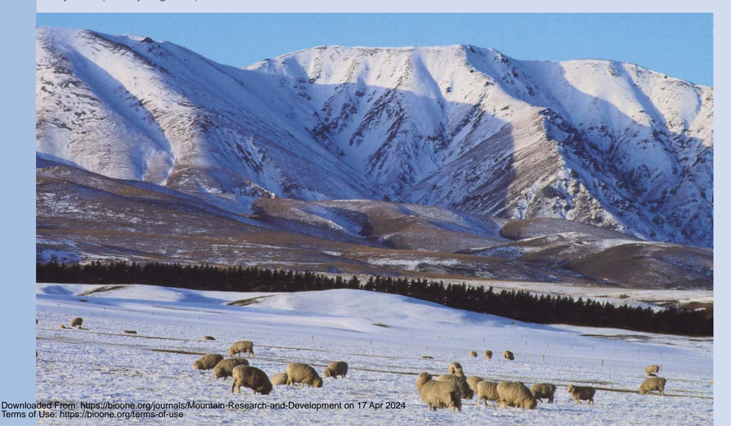
FIGURE 1 Winter scene in subhumid Naseby district, South Island, New Zealand, with sheep being fed silage on developed pastures sheltered by belts of pines planted there for this purpose. The Hawkdun Mountain slopes in the distance, used for late summer grazing to conserve herbage grown under erratic rainfall on lower ground, are now being contested for conservation objectives.

Sheep numbers on high-country runs grew for the first 20 years and then became static or declined for some 80 years. The European rabbit, introduced for misguided social purposes, periodically increased in numbers toward plague