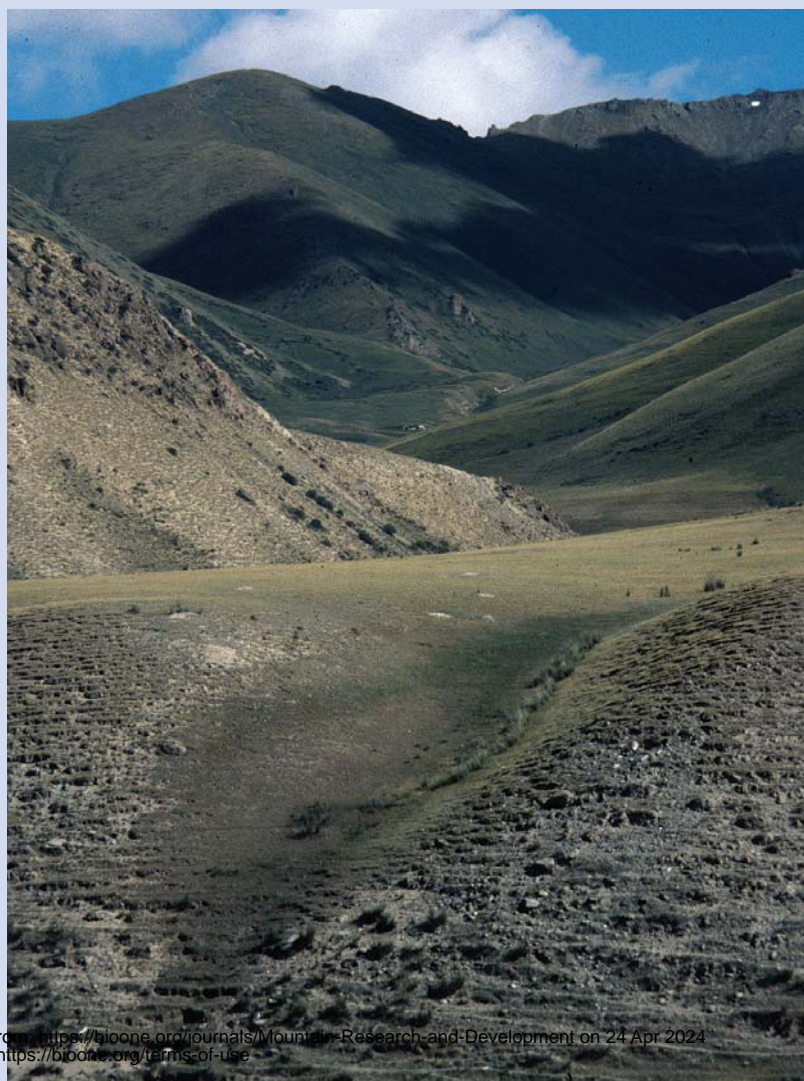
FIGURE 3 Degraded pastures near Tolok, Kyrgyzstan. Such signs of degradation are not a recent phenomenon but stem from Soviet times.

make use of available assets, including human resources, at the household level.