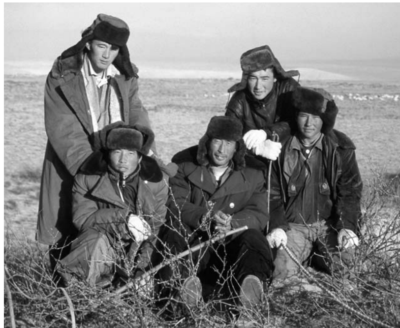
FIGURE 3 Group-herding arrangements make possible economies of size with respect to herd supervision. Illustrated is a Kazakh herding group in spring–autumn pasture, Burqin, Xinjiang. De facto collective tenure persists in this pasture in part because of its patchy nature and the related difficulty of subdividing it equitably between groups or households.

The local-level arrangements for grassland management described in the previous section are molded by the economic, social, and ecological realities of pastoralism in western China. Rangelands are by nature extensive, of low productivity per unit of area, and spatially and temporally variable. This makes the net benefit of establishing private exclusion through fencing marginal at best, which is reflected in the frequent comment of pastoralists that even if they wanted to fence their pastures, they could not afford to. Instead, exclusion is more economically achieved through a combination of collective or group tenure arrangements, which are associated with shorter boundaries to be monitored and enforced, the direct observation of herders in the field, and the stationing of grassland protector households to ensure seasonal exclusion. Collective and group tenure arrangements also facilitate group-herding arrange-