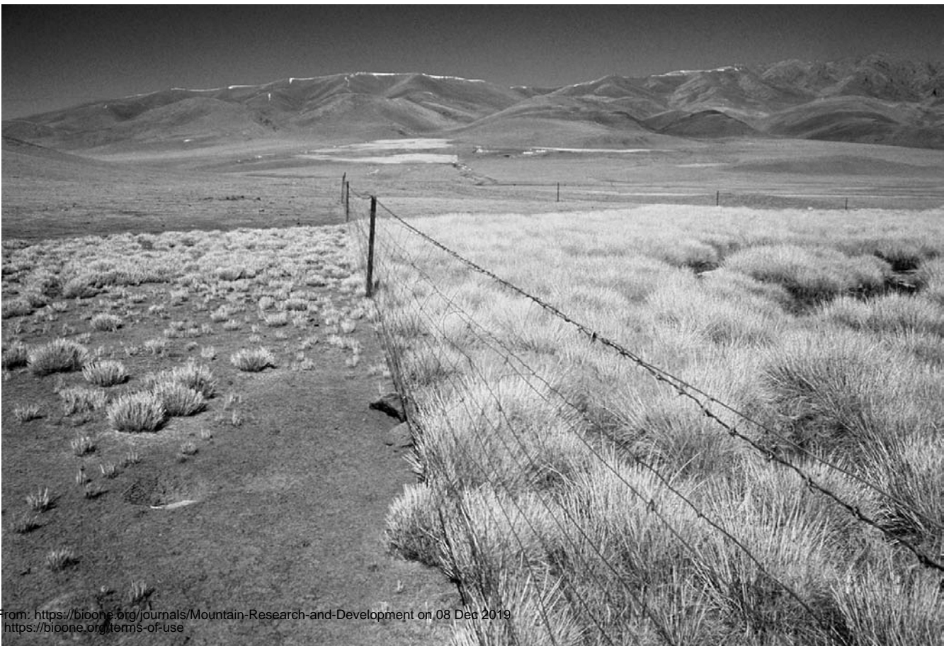
FIGURE 4 The fencing of swamp grassland in Naqu, Tibet, represents a case of a collective tenure and management regime. Household access to the fattening pastures resulting from such an arrangement is effectively controlled by the collective.

The Naqu County government of the TAR, with financial support from the Tibet Poverty Alleviation Fund, has established a number of fattening pastures that have been formally contracted to the village (either administrative or natural) as a whole. The location of boundaries was decided through consultation with com-