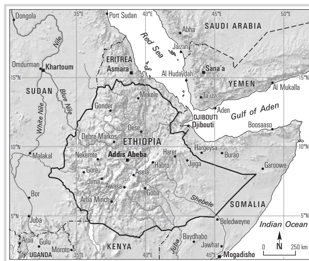
FIGURE 1 Map of Ethiopia. (Map by Andreas Brodbeck)

Khat ( Catha edulis ) is an evergreen tree grown for the production of leaves that are used as a stimulant. It can reach 25 m in height when grown naturally (Klinge 1998), but it is kept under manageable height when grown as a cash crop and for home consumption. The economically important products are its young leaves and tender twigs, which are chewed for their stimulating effect. Major areas of production and consumption are East Africa, southwest Arabia, and Madagascar (Pantelis et al 1989). Khat grows on well-drained soil under broad climatic conditions and tolerates drought for sev-