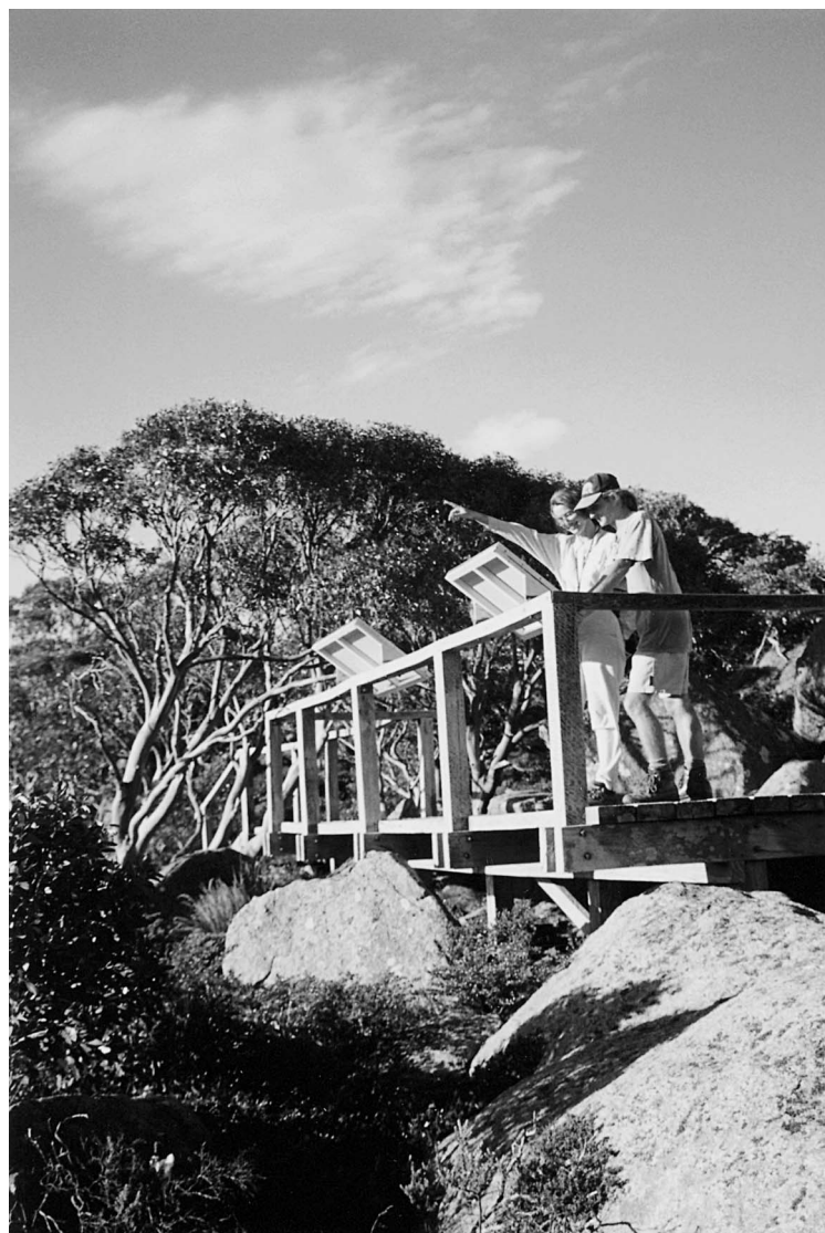
FIGURE 4 Sightseeing is the second most popular activity in the Kosciuszko alpine area. Lookouts such as this one at Charlotte's Pass provide visitors with interpretation and safety messages. This type of wooden structure protects the immediate environment from excessive trampling.

Norris 1999; Growcock 1999; AALC 2000; Buckley et al 2000). Changes in creek flow regimes as a result of snowmaking, snow grooming, and harvesting have been found, although most research is for mountain regions overseas (Good and Grenier 1994; Growcock 1999).