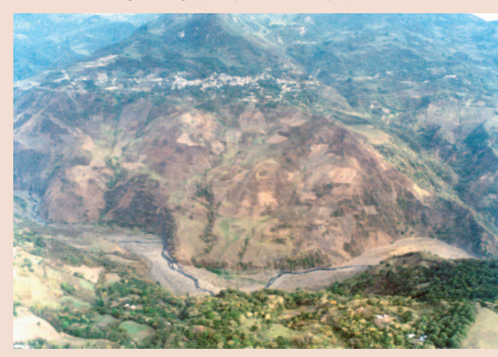
FIGURE 2 Several communities are located on slopes where landslides occurred long ago, and the risk of new landslides occurring remains high.