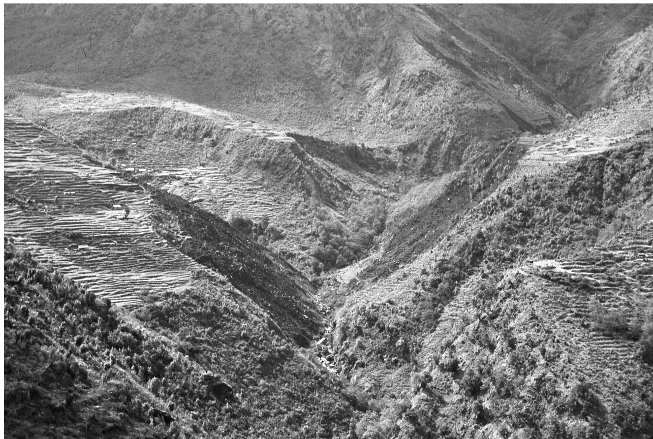
FIGURE 3 Forest near Lowagen affected by slash-and-burn maize cultivation. After harvesting maize, the cultivated field is usually abandoned. Recently, people have started cultivating chiraito ( Swertia spp.) with maize.

chiraito ( Swertia spp.) as cash crops. Dynamic changes in forest/agricultural lands in the Middle Mountains of Nepal are also discussed by Kollmair and Müller-Böker (2002). This important topic should be studied systematically in the future.