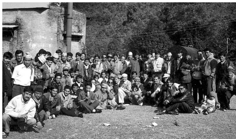
FIGURE 3 Community members meet to discuss a forest-related conflict in a formal process of conflict resolution in Pawoti village, Dolakha District, in 1999. This meeting was organized by the local Village Development Committee. Typically, women are absent.

Conflict is an outcome of human activity. Hence only effective human interaction, mutual learning and collective action can help manage conflict. Walker and Daniels (1997) have also highlighted the importance of collective learning in conflict resolution. Multifunctional use of resources is a major cause of conflict. This can be addressed by collective efforts. Integration of local needs, interests, experience, skills and knowledge, and external scientific knowledge into the existing conflict resolution system is essential to address growing conflict.