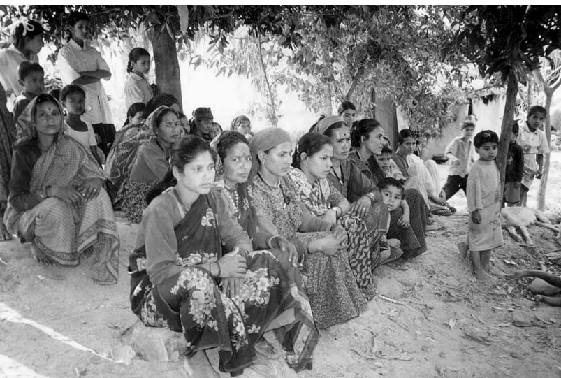
FIGURE 2 Women of the Brahmin and Chhetri castes in Pawoti village, Dolakha District, discuss a dispute over a drinking water source in order to settle the conflict between two communities informally.

politicians use FUGs as a platform for political gain. Conflict between the Federation of Forest Users and the Forest Department became severe when the government took over some of the authority and responsibility granted by the Forest Act to the users of community forests.