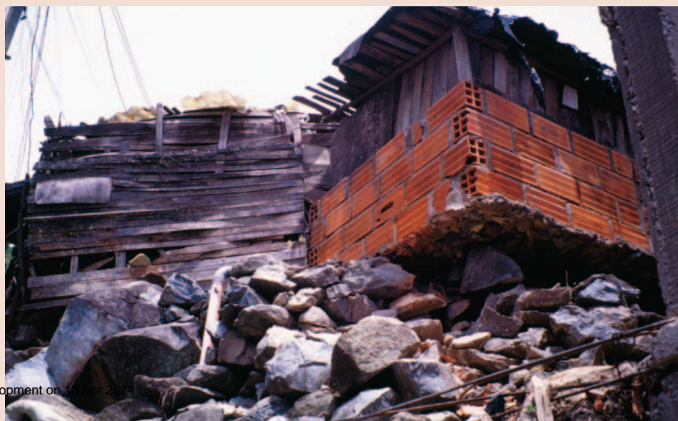
FIGURE 2 Use of land for spontaneous settlement, a problem being addressed by PRIMED in the so-called high-risk districts.

In the rich neighborhoods on the flat terrain of the valley, the response to scarcity of urban land and socio-cultural transformation was to increase the density of the built environment. Everywhere so-