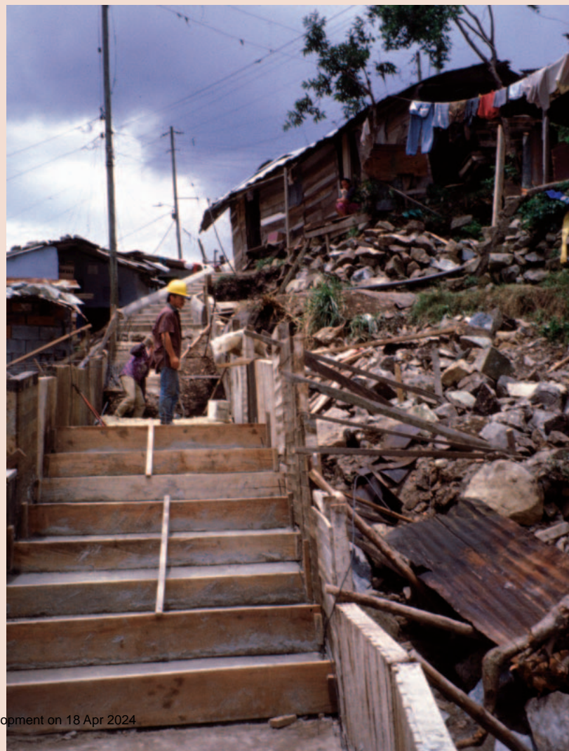
FIGURE 4 Participatory district improvement. Houses in the improved PRIMED districts are still only accessible by steps and paths due to environmental fragility. Residents continue to dream of driving cars to their homes, however.

An important strategy of PRIMED was to promote participatory local diagnostic and planning processes and management of projects by grassroots organizations in the neighborhoods. This was advocated in order to gain legal status and establish constitutionally determined conditions for negotiating project funding and implementation with the municipality, NGOs, and private actors. The local diagnostic and planning processes meant that inhabitants would traverse the neighborhoods, to socialize knowledge and construct a collective vision of the future (Figure 5). This generated important discursive public spaces in the districts, the outcome of which was a far-reaching potential for