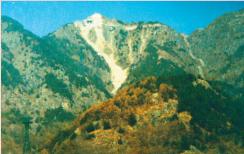
FIGURE 4 Scar (15,000 m 2 ) left by construction of a cable car on the Yueguan peak of Mt Taishan.

connected with the management of parks and heritage sites, with no clear aims and measures. Management of world heritage sites and parks is actually left to local governments, which, in turn, usually rent them to tourist corporations.