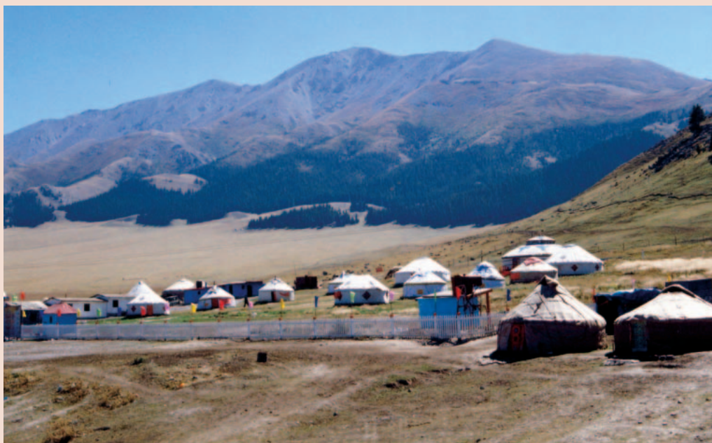
FIGURE 5 More sustainable tourist accommodations built by local people near Sayram Lake, in the Tien Shan; there are no permanent structures around the lake. Damage to the ground from tourist use can be repaired.

stand the significance of protecting world heritage sites and parks in mountains. Specialists, eg Xie Ninggao (Peking University) and Li Jisheng (Shandong Province), have revealed the problems of over-urbanization and landscape damage in mountains, and appealed for measures and actions to halt careless behavior. International pressure has forced some local governments to invest large sums to remove hotels and even local residents from scenic spots. In some areas, more sustainable tourism has been initiated (Figure 5).