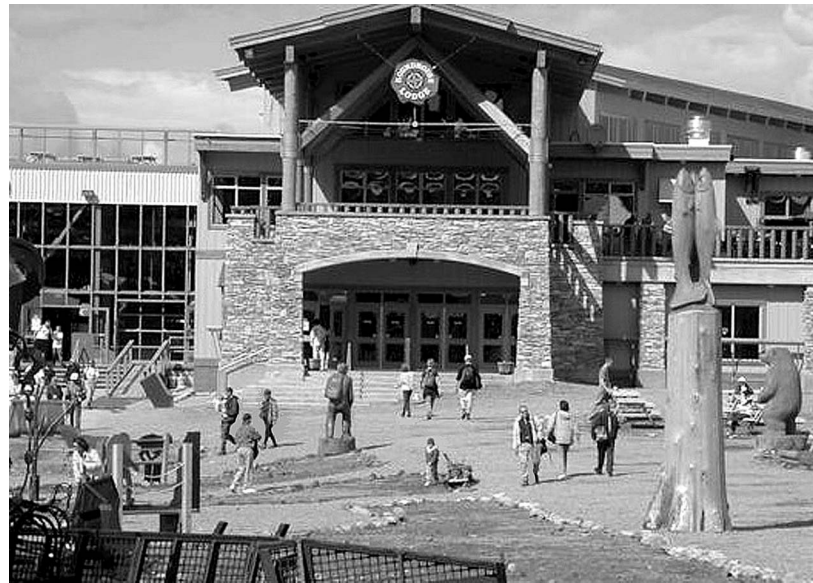
FIGURE 2 The Roundhouse and top of the gondola area (Site 1). This is the most heavily developed and visited site in the Whistler Mountain ski area.

In conclusion, there has been little empirical research to (1) examine summer visitors and their experiences at alpine ski areas, and (2) apply the behav-