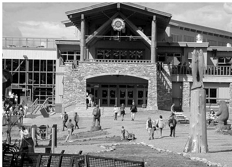
FIGURE 2 The Roundhouse and top of the gondola area (Site 1). This is the most heavily developed and visited site in the Whistler Mountain ski area.

In conclusion, there has been little empirical research to (1) examine summer visitors and their experiences at alpine ski areas, and (2) apply the behav-