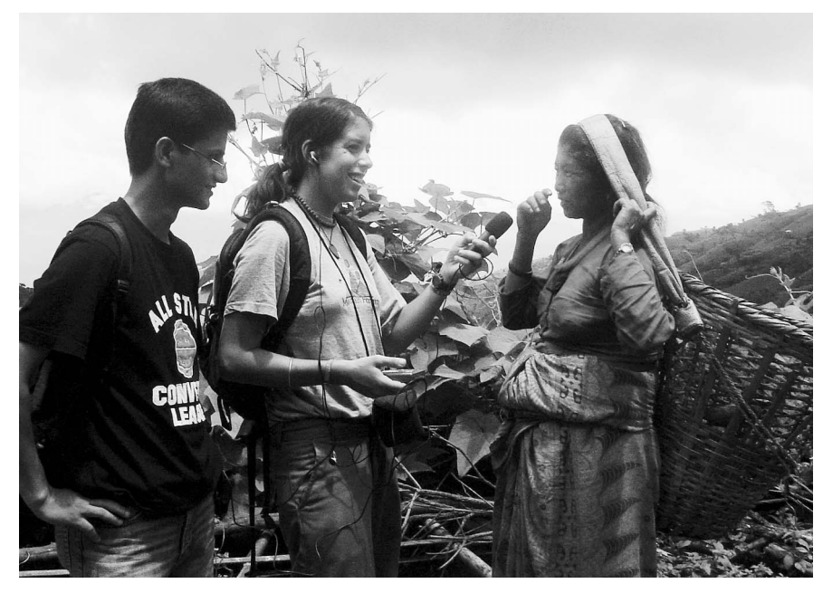
FIGURE 1 Interviewing a Tamang woman. Bhojeni, Kathmandu District, Nepal.

In the first phase, 8 such programs will be produced. As this is a pilot phase, the purpose is to assess whether such an approach—which