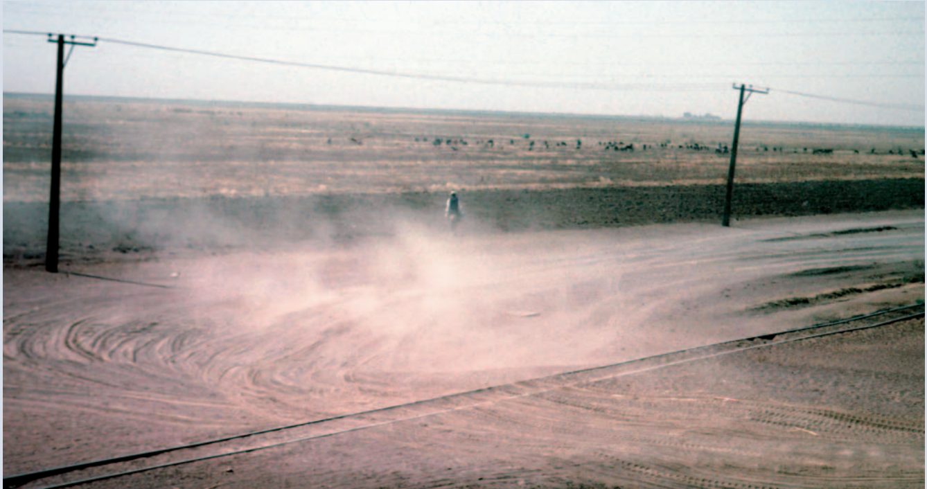
FIGURE 5 International conflict transformation workshops alone cannot solve water scarcity problems, which may be related to climatic fluctuations or irrigation mismanagement. Large-scale irrigated area in Gezira, Sudan, during a period with little water.

seen how an informal setting such as this could achieve more tangible outputs than a formal setting, which has a number of constraints." Ideas were developed to enhance cooperation and development in the Eastern Nile Basin. These ideas entail future training events, with a mixed student body from the 3 countries, as well as activities to support development in the region in such a way as to keep ownership in the hands of the people living in the region.