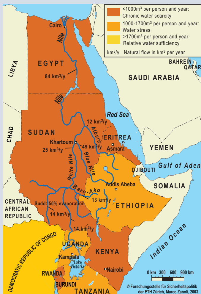
FIGURE 1 Projected water scarcity in the Nile Basin countries in the year 2025. The figures are based on UN population projections and FAO data of total actual renewable water per country; regional differences of water availability within a country are not considered. (Map by Marco Zanoli, Center for Security Studies, ETH Zurich; data: FAO and UNFPA).

assistance of an outside person who is accepted by the actors is often required.