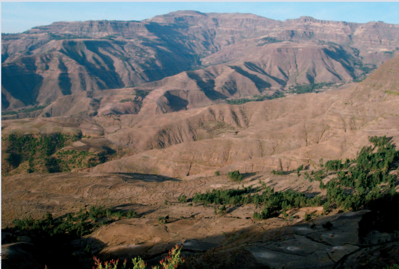
FIGURE 3 Small-scale rainfed agriculture in the Ethiopian highlands.

The workshop series was not intended to be a negotiation forum, as such fora