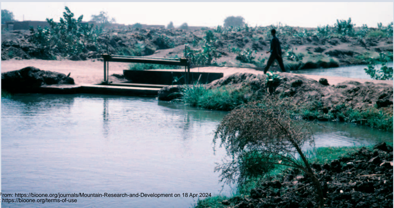
FIGURE 6 Large-scale irrigated area in Gezira, Sudan.

It is difficult to evaluate the impact of such a workshop series on the wider sociopolitical environment (Figures 5 and 6). Some indication can be deduced from the participants' evaluations, which were very positive. The openness and the progress made by the participants during the workshops would not have been possible without positive steps towards coopera-