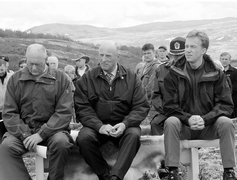
FIGURE 3 The opening of Dovrefjell-Sunnalsfjella National Park in June 2002. From left to right: the mayor of Dovre municipality and leader of Dovre Mountains Council, Erland Løkken; King Harald of Norway; and the Minister of the Environment, Børge Brende.

In the designation process for both Dovrefjell and Geiranger-Herdalen, the actors involved emphasized the importance of broad representation of various stakeholders in the appointed reference groups. This