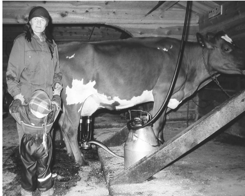
FIGURE 4 A Norwegian farmer and her grandchild in a mountain summer farm. Such farms, traditionally run by women, are based on dairy production. The two case studies in this article reveal that despite their important role in the community and in production, women are grossly under-represented when it comes to local participation in conservation planning.

elections and appointments of local participants. Furthermore, we find structural features to be important. The most important explanatory factor was found at the national level, where the Norwegian Ministry of the Environment and the Directorate for Nature Management have neglected their obligations to mainstream gender equality.