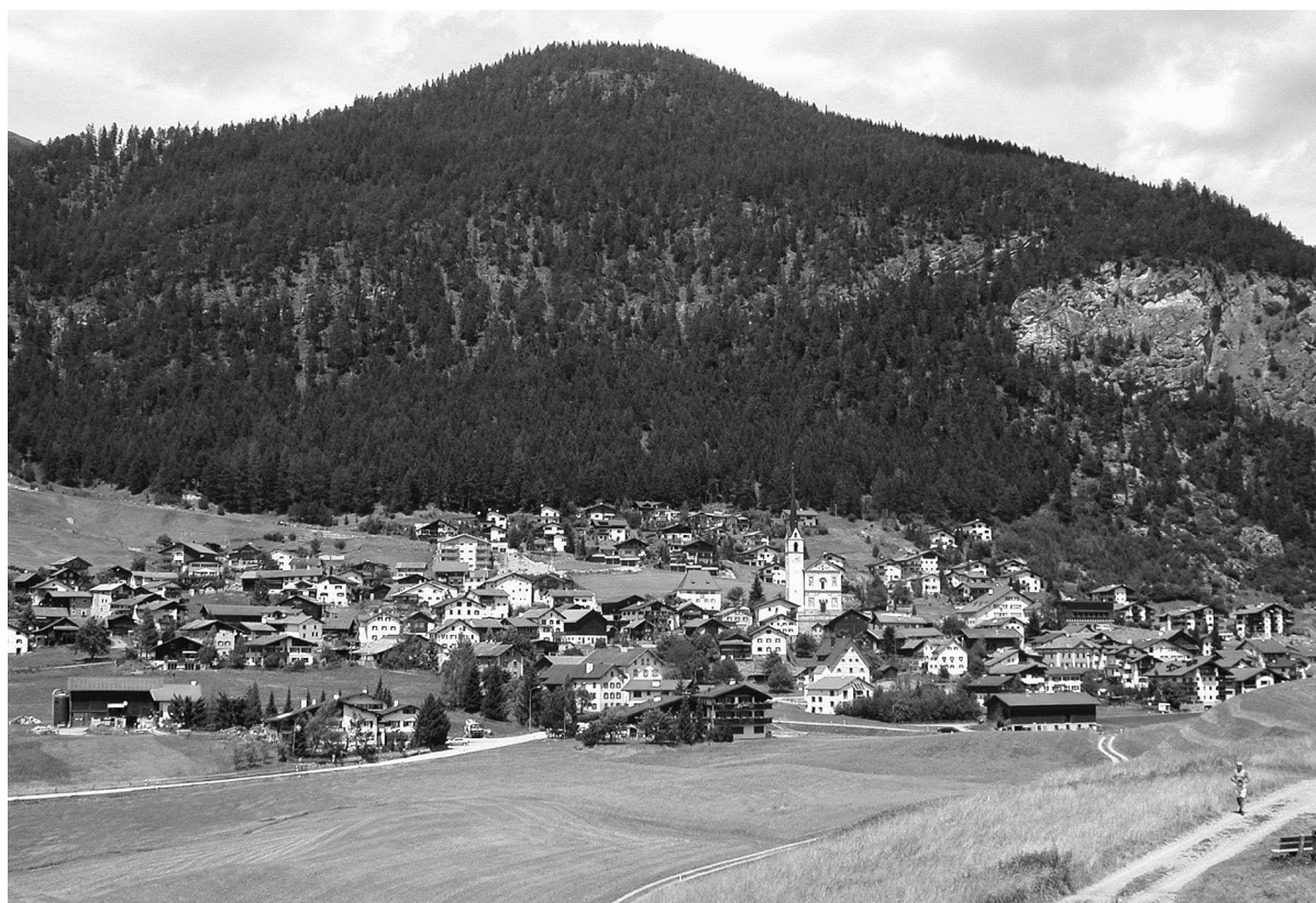
FIGURE 1 The village of Alvaneu, Canton of Grisons, Switzerland.

These studies elucidate that for tourists, visited places can be as deeply meaningful as for locals, notably as symbols of important experiences or because of the places' restorative value. But empirical studies focus mostly on defining the constituents of sense of place, or on the strength of place relations. Stedman's (2003) quantitative study in northern Wisconsin demonstrates that sense of place is not just based on social constructions, but also on some material reality, ie on concrete landscape characteristics. Hay (1998) found in a survey study on Banks Peninsula, New Zealand, that the sense of place of local Maori people is deeply rooted, whereas the sense of place of tourists is rather superficial, due to different residential status and thus different ancestral and cultural connections. Still, no studies have examined the contents and conditions of sense of place, particularly with regard to group differences. Empirical knowledge of differences in sense of place between the 2 main interest groups with respect to Alpine landscape development, locals and tourists, is especially poor.