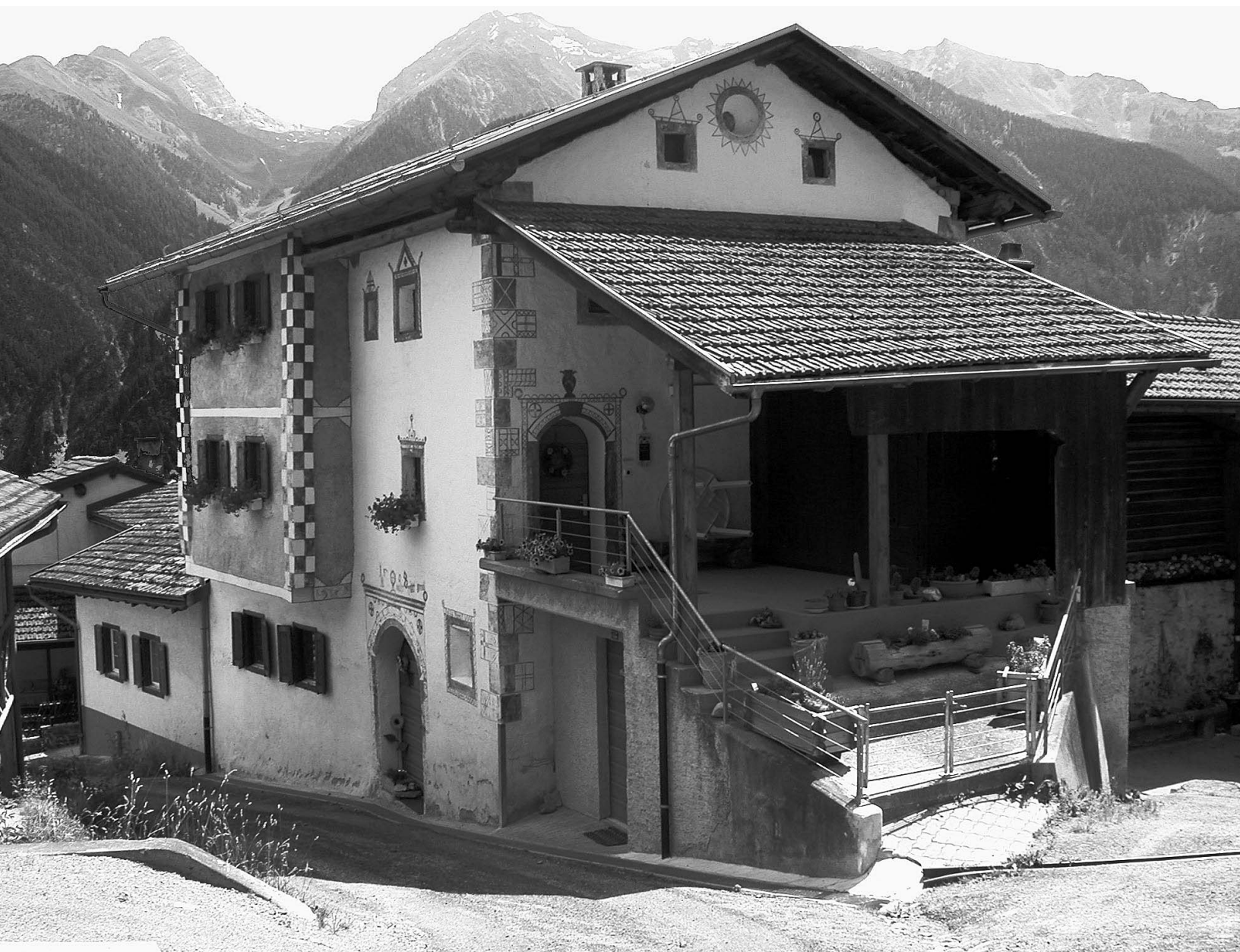
60 FIGURE 4 Construction in a traditional style, typical of Alvaneu.

friends and their common experiences of place. Furthermore, tourists seemed to be particularly satisfied if they got to know local people and especially proud if they established friendly relationships with them. Therefore, the key category personal relationships likewise encompasses individual and social aspects.