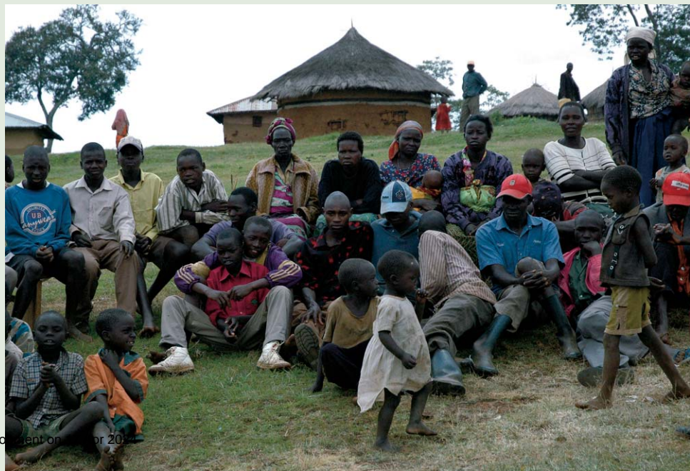
FIGURE 3 Discussion with local people in Tuikat village, Mount Elgon, Uganda.