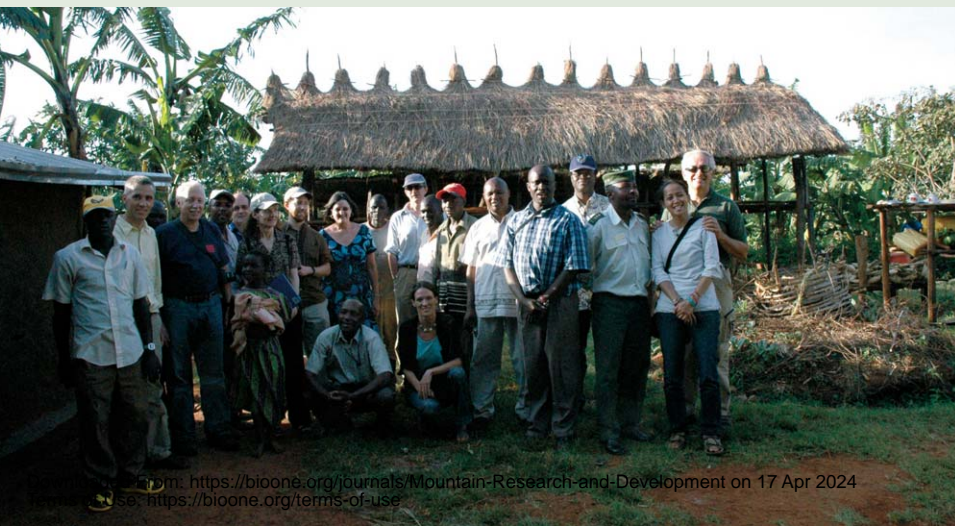
FIGURE 4 Collaboration between program partners (here: representatives of IUCN, MERECP CIFOR, Ecoagriculture Partners, and local Ugandan Wildlife Authority institutions meet in the field) is successful in the Mount Elgon area.

Approximately 1.5 years into the implementation of the program, the outcomes, in the particular institutional successes described above, are becoming manifest. Additionally, activities such as illegal harvesting of forest produce and poaching have been drastically reduced and previously degraded sites within the protected areas have started to regenerate. However, the program has not yet assessed the impact of these successes on the ecosystem and its multiple functions and services. A systemic analysis of the impact of MERECP on the multifunctionality of the mountain ecosystem is urgently needed.