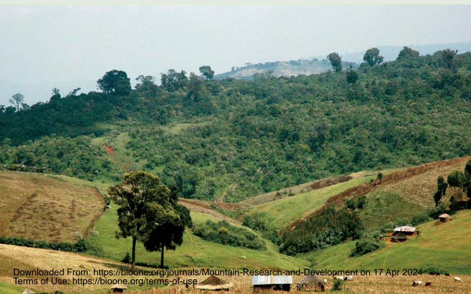
FIGURE 2 Mount Elgon National Park boundary in Uganda and neighboring agricultural area with high population growth that exerts pressure on park resources.

In a Memorandum of Understanding (MoU) on Cooperation on Environmental Management between Kenya, Tanzania, and Uganda (upgraded to the Protocol on Environment and Natural Resources, and awaiting approval by the Heads of State Summit) signed in 1998, the Partner States have committed themselves to promoting public awareness programs and access to information, as well as measures to enhance public participation in environmental and natural resource management issues. Based on this MoU and other national policies and laws, MERECF was designed between 2001 and 2005. The participation of beneficiary communities and institutions active in the Mt Elgon ecosystem from the earliest planning stages was therefore perceived as the best strategy to ensure the long-term success of MERECF and its smooth integration into national and local government development plans, work plans, and budgets in both Kenya and Uganda (Figure 3). Com-