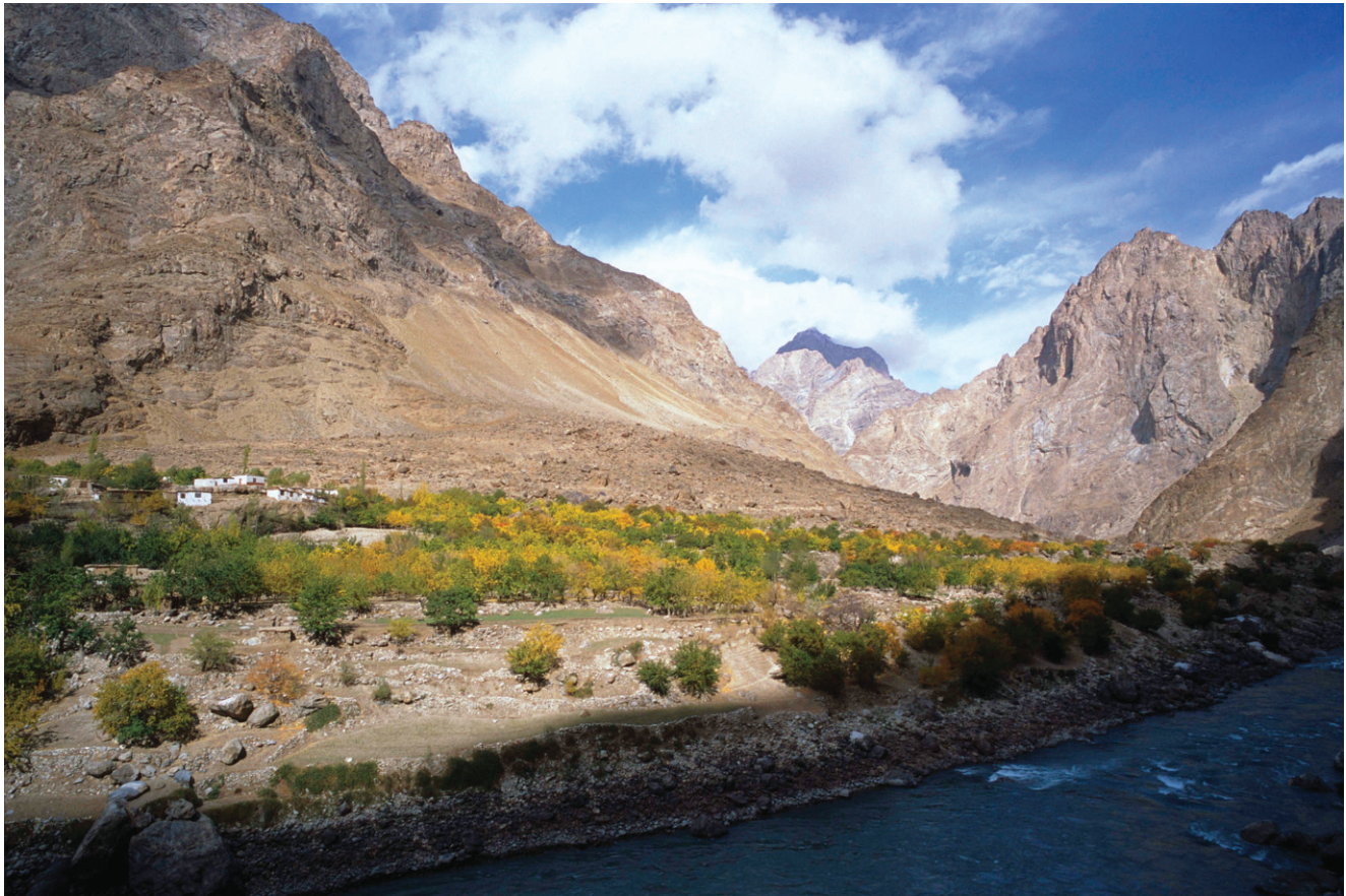
FIGURE 1 The Western Pamiri agricultural landscape: villages are nestled along river beds or on alluvial fans—usually the only flat land found in this region.

and malnutrition, conserving crop diversity is less a choice than a basic necessity for survival. The people of the Pamirs are no exception. Pamiri agriculture is characterized by a great diversity of unique fruit varieties, which have a prominent place in local food culture. A recent study found 33 commonly cultivated varieties of apple, 40 apricot varieties, and 37 mulberry varieties (Bioversity International 2010).