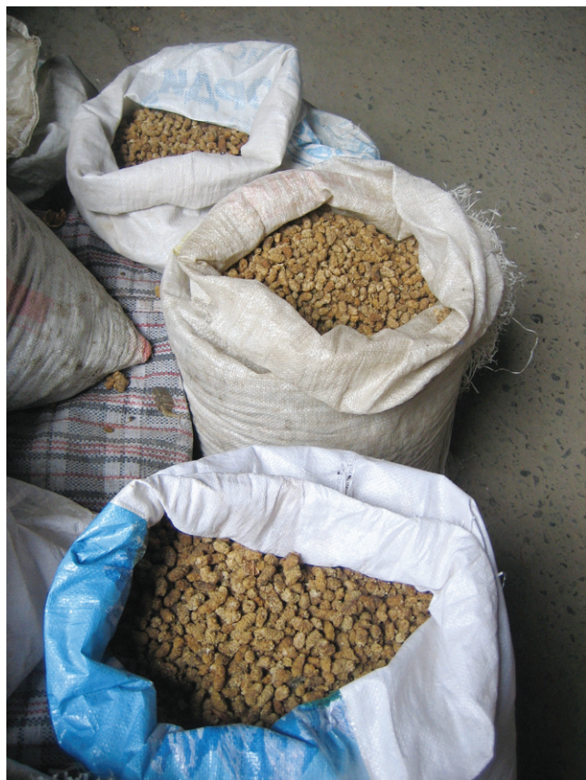
FIGURE 5 Dried mulberry sold on the local market in Khorog.

indigenous people's livelihood security has been based on the consumption of tubers and grains, such as quinoa. Farmers have adapted and selected local varieties of these crops to reduce their vulnerability to a range of environmental risks (Hellin and Higman 2005). Pamiri farmers are astutely aware of the importance of maintaining this crop diversity: particular varieties are cultivated for particular reasons (see Supplemental data , Table S1; http://dx.doi.org/10.1659/MRD-JOURNAL-D-10-00109.S1 ), and knowledge about the nutritional and medicinal qualities of fruit varieties is often detailed.