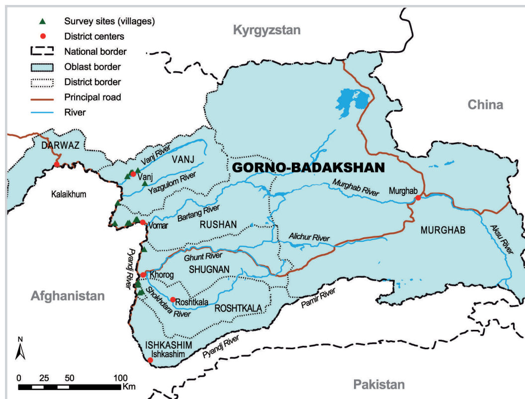
FIGURE 2 The survey area in the Western Tajik Pamirs, GBAO Province. (Map by Frederik van Oudenhoven, adapted from http://www.pamirs.org/trekking.htm )

of researchers of PBI. Households were selected using purpose-sampling. To enhance the representativeness of the sample, families were selected to be of varying socioeconomic levels with different levels of dependence on fruit tree cultivation. A semistructured questionnaire was used to collect information about the reasons for cultivating and maintaining specific varieties (local and introduced), harvesting, processing, marketing, and the income generated from the sale of the particular fruits.