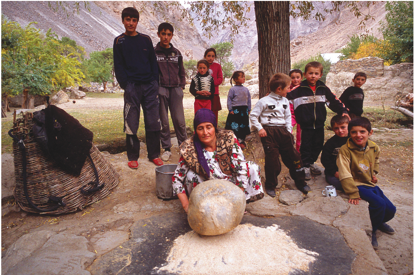
FIGURE 3 A mother in the Yazguliem valley in the western Tajik Pamirs preparing pikht for her children.