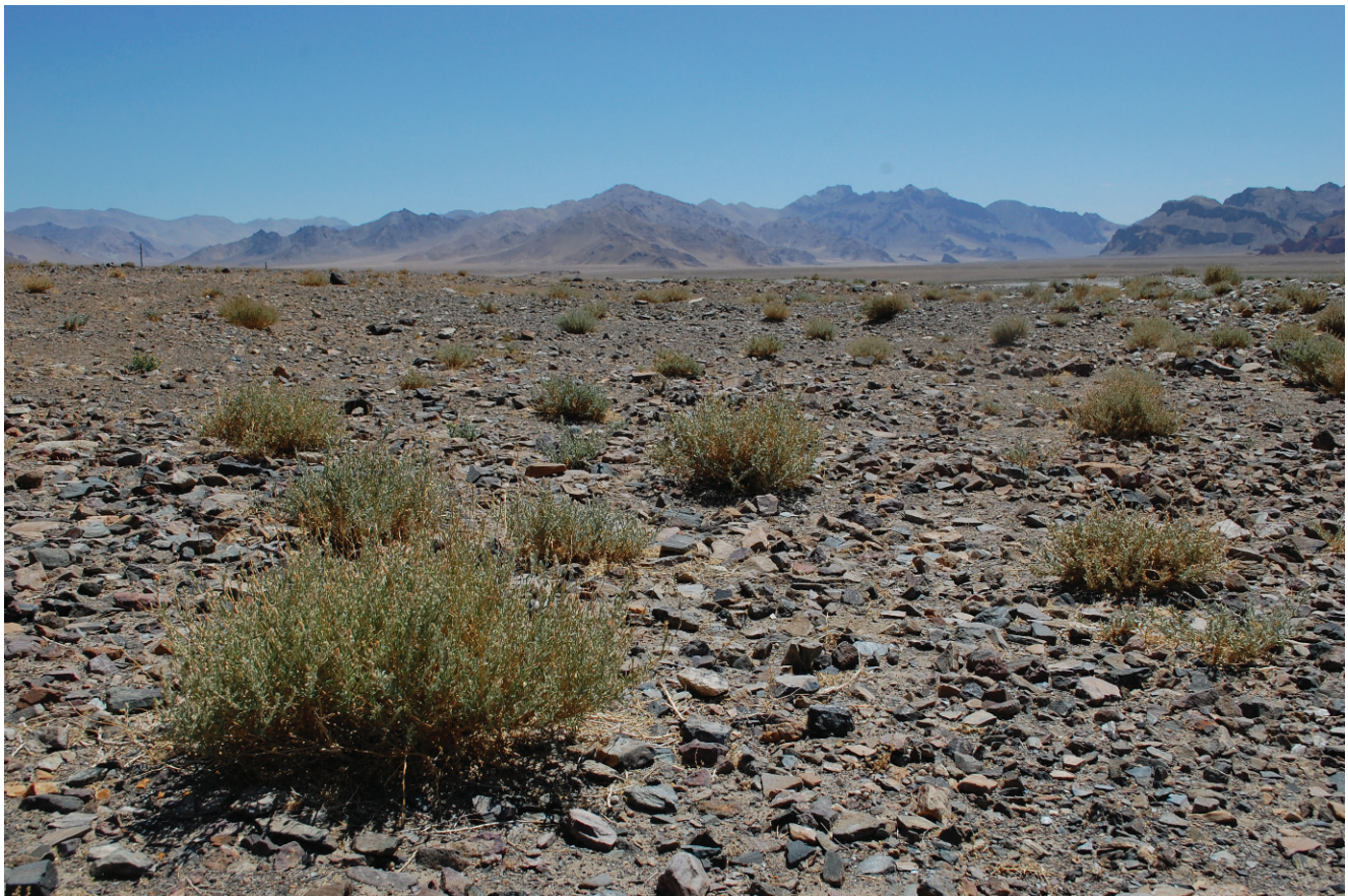
FIGURE 2 On the arid high plains of the Eastern Pamirs around Murgab, dwarf shrubs form the only vegetation.

insulation measures. Therefore, a new system of in-kind loans was introduced in 2010. The microloan organization provides wooden construction elements and insulation materials, and coordinates trained construction workers and transport. Clients reimburse the equivalent of these products and services in cash as they would a standard loan.