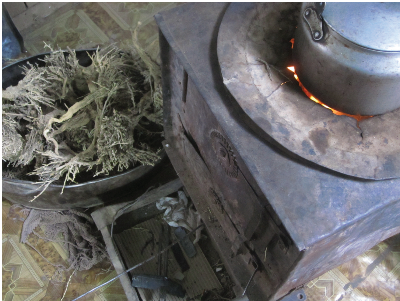
FIGURE 6 In Murgab town, it is mainly poor households that dig out teresken shrubs and fire them in the stoves for heating and cooking.

by poorer households and households in the villages that surround Murgab. Thermal insulation can only be part of an integrated strategy to solve the energy crisis in the Eastern Pamirs. In addition, the provision of alternative fuels (firewood, coal, gas, solar energy, and hydropower) and the dissemination of energy-efficient technology (heating and cooking stoves for winter, cooking stoves for summer) are necessary.