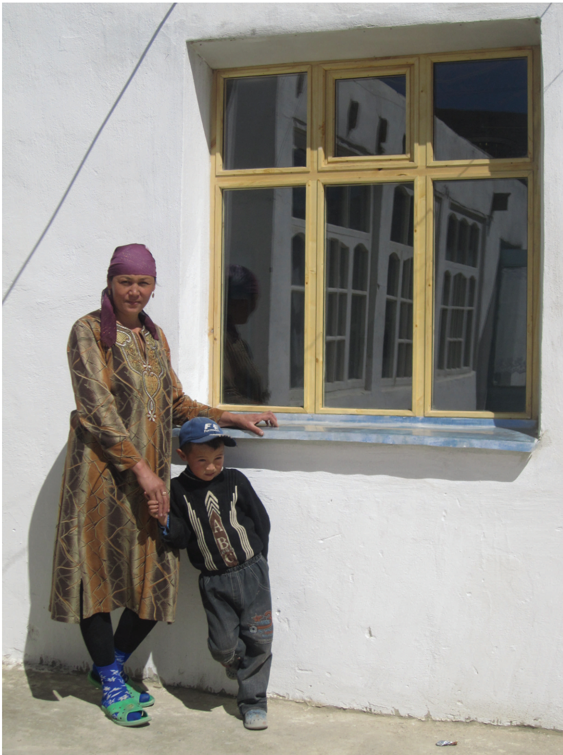
FIGURE 4 The new wooden windows are double glazed and hermetic. In the past, many windows were only single glazed, had broken glass, and were covered with plastic foil during winter to reduce the loss of heat.