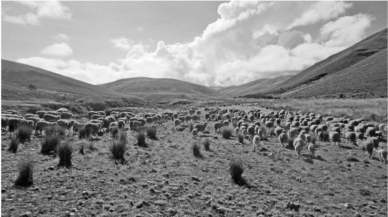
FIGURE 3 Many of the members of the community have flocks of sheep that, like this one, consist of both their own and others' animals.