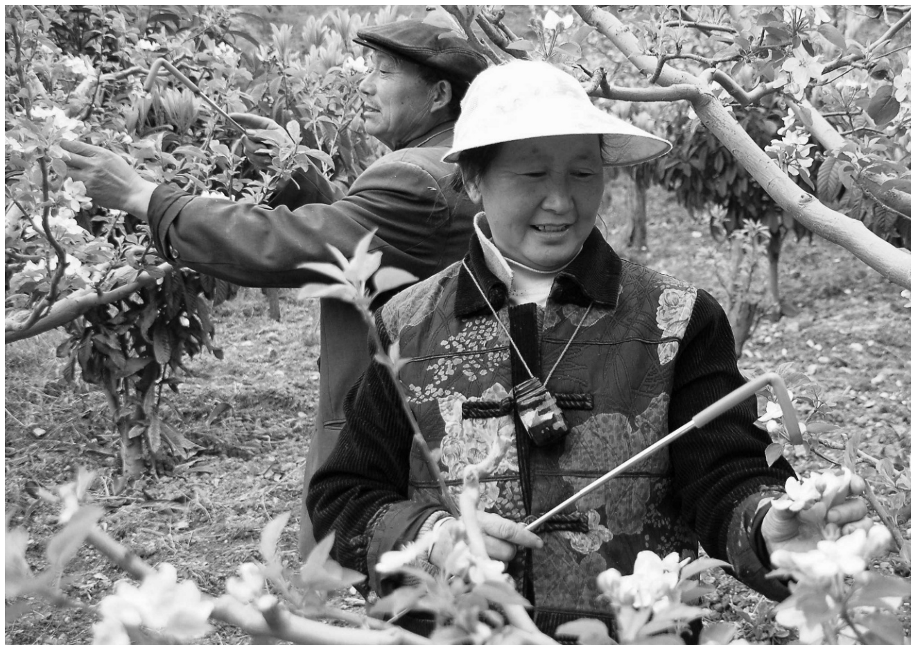
FIGURE 2 Farmers pollinating apple flowers in Feng Mao village.

chosen for gathering folk observations about the scale and pace of changes in agricultural systems and climate. A few beekeepers in the valley were also interviewed to understand access to beekeeping as a tool for managing fruit pollination in the valley and whether farmers are now using it. Secondary data on population, agriculture, average land holdings, and meteorology were accessed from literature and government sources.