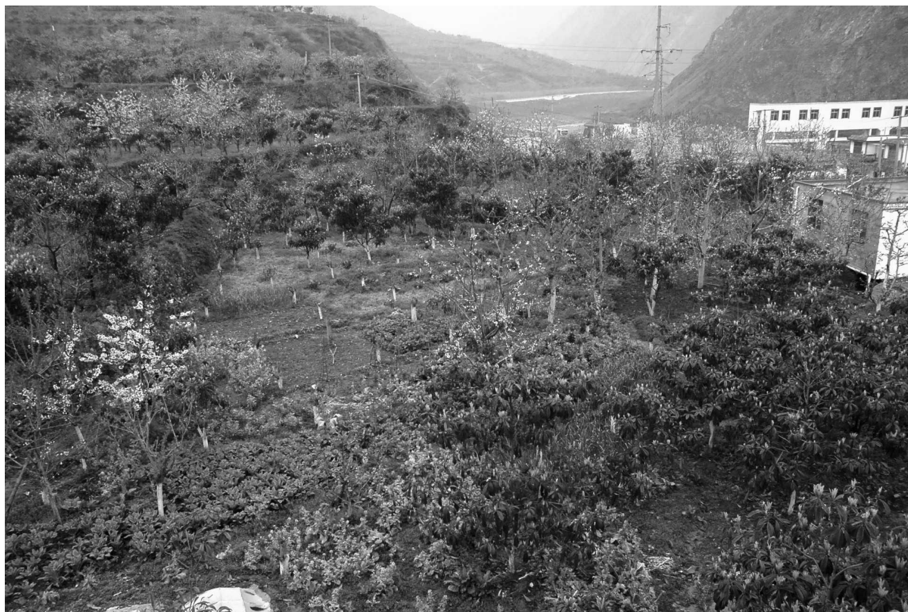
FIGURE 4 Mixed fruit farming in study area. An orchard with apples, cherries, plums, loquats, and vegetables in Feng Mao village.

hiring them varies from US$ 12–19/person/d, which has led to a substantial increase in the cost of producing apples. This, coupled with the falling market prices for Maoxian apples, has been the key factor that compelled farmers to look for other crops.