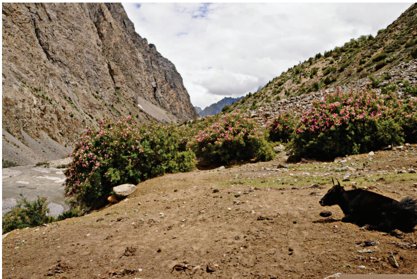
FIGURE 1 Yak on one of the summer pastures of Hushey.

domestic stock. While Himalayan ibex ( Capra sibirica ) and in some areas markhor ( Capra falconeri ) remain important food staples, along with other small mammals and birds, snow leopards feed to a large degree on domestic livestock, including yak, goat, and sheep (Mishra 1997; Anwar et al 2011).