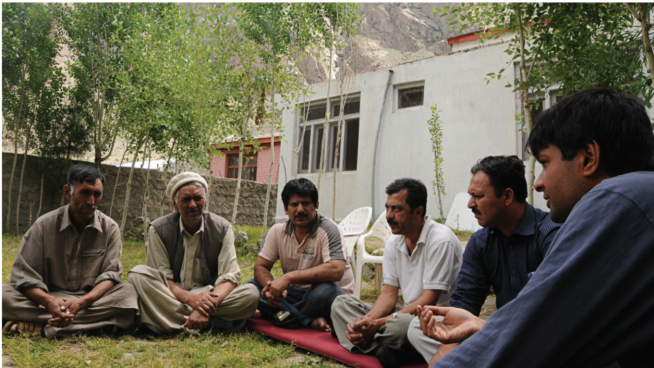
FIGURE 3 Meeting with the Snow Leopard Conservation Committee in Hushey, Ganche Valley.

catalyst for bridging cultural and economic differences among factions within the community.