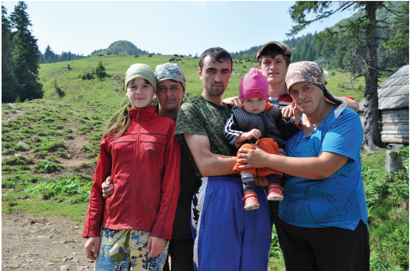
FIGURE 2 Hutsul family that used to work each summer on a cattle farm below Mt Petros in the western Chornohora, just outside the CBR.

land ownership. These differences, in our opinion, have been recently reinforced by a shift in land management policy: 1-year leases for mountain pastures are being replaced by 49-year leases. This has already been implemented in the Ivano-Frankivsk region. Adding a further degree of complexity to land management patterns in the region, some of the farms operate within 1 of 2 large protected areas: the Carpathian National Nature Park (CNP) and the Carpathian Biosphere Reserve (CBR).