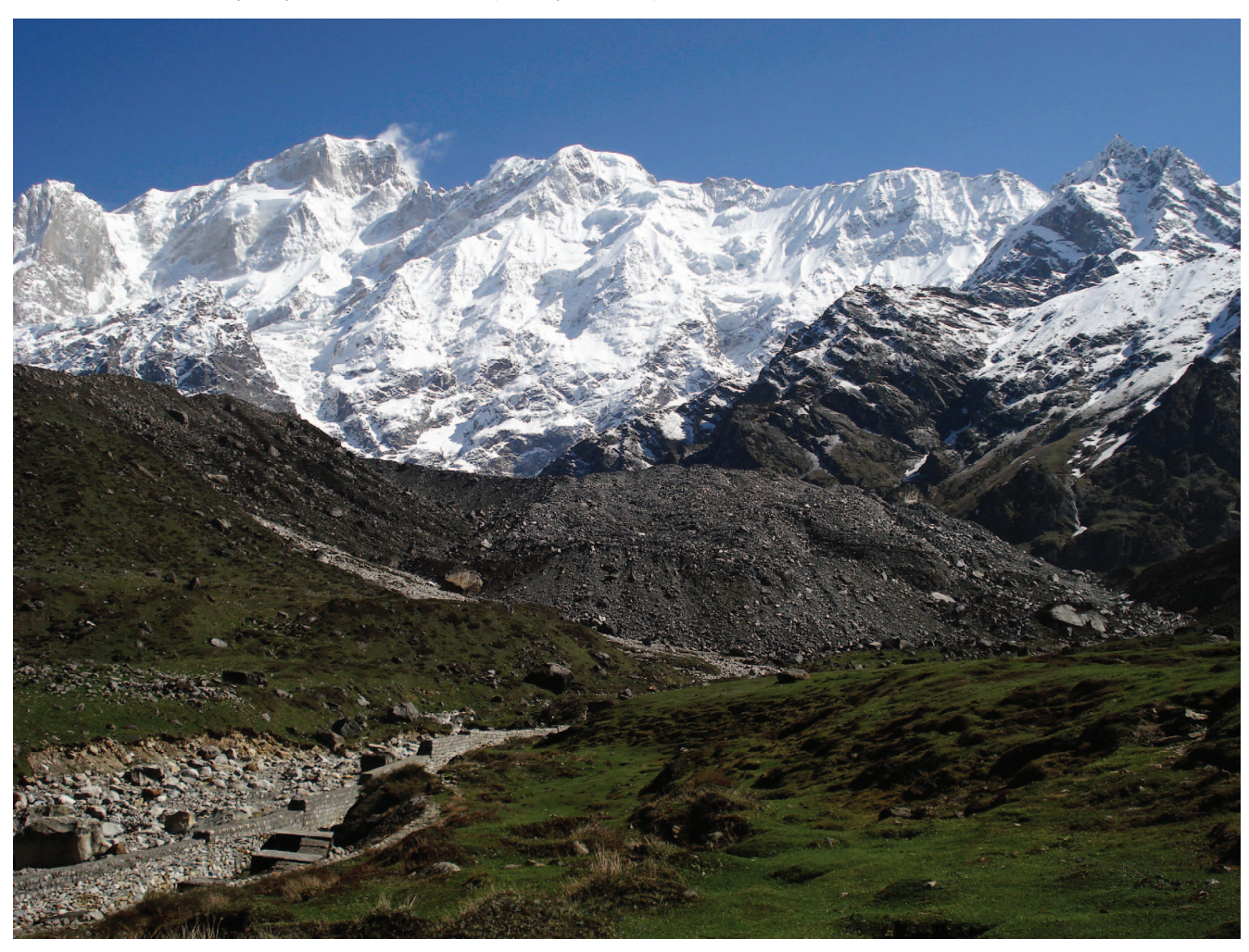
FIGURE 2 Kedarnath town at the foot of the Kedarnath glacier is an important pilgrimage site; it made international news when thousands of pilgrims died in June 2013 due to floods caused by heavy rain and a lake collapse.

of accurate meteorological data and monitoring systems in most watersheds and in particular at higher elevations (Ragettli et al 2015) accentuates the problem.