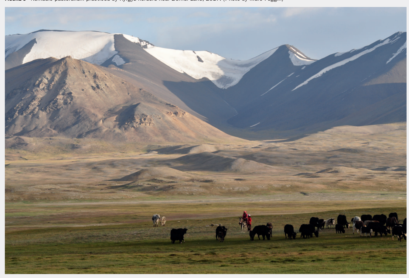
FIGURE 3 Nomadic pastoralism practiced by Kyrgyz herders near Zorkul Lake, 2017.

Pamir, and Karakoram mountain ranges traversing Kyrgyzstan, Tajikistan, Afghanistan, and Pakistan, MSRI has begun the capacitybuilding-oriented Pathways to Innovation project, supported by the International Development Research Centre. This project aims to strengthen 2 universities in Afghanistan and 1 university in Tajikistan by supporting a suite of locally developed agricultural and sustainable development projects and codeveloping and delivering a certificate program in natural resources management. In the near future, MSRI will also develop a master's program in mountain development, focused on mountain livelihoods and sustainability within the context of global change. Special attention will be given to climate change and adaptation, food systems and the management and governance