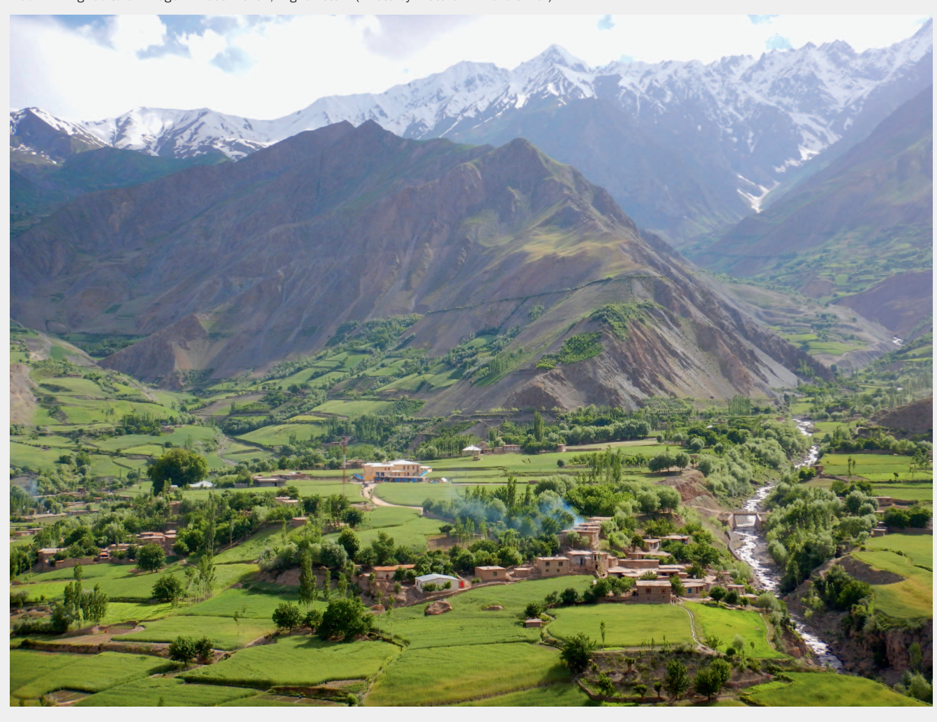
FIGURE 1 Agricultural village in Badakhshan, Afghanistan.

areas—for example, through outmigration to urban centers (with a resulting loss of practical knowledge) or the receipt of remittances and new ideas (which can affect how natural resources are managed). The shrinking or homogenizing of the world and loss of sociocultural diversity can have major implications for agrobiodiversity and traditional knowledge systems, generally reducing mountain societies' capacity to adapt to regional and global changes (Foggin 2016; Schmidt-Vogt et al 2016).