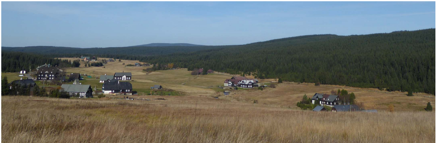
FIGURE 1 Jizerka, one of a few settlements on the upper plateau of the Jizera Mountains, in 2017. The forests covering the upper plateau are mostly spruce, post-pollution plantations that require diversification.

Biological Diversity (CBD 2012) in the Czech Republic, to which the project presented in this article contributes. The forests in the Jizera Mountains are for the most part managed by the state-owned enterprise Forests of the Czech Republic (LČR). The forestry managers in the Jizera Mountains have to obey the legislation on conservation and are therefore supervised by the administration office of PLA. The diversification project has been implemented in the forest district Jizerka (LČR). The project is promoted by LČR and NCA CR in terms of funding as well as organizational support.