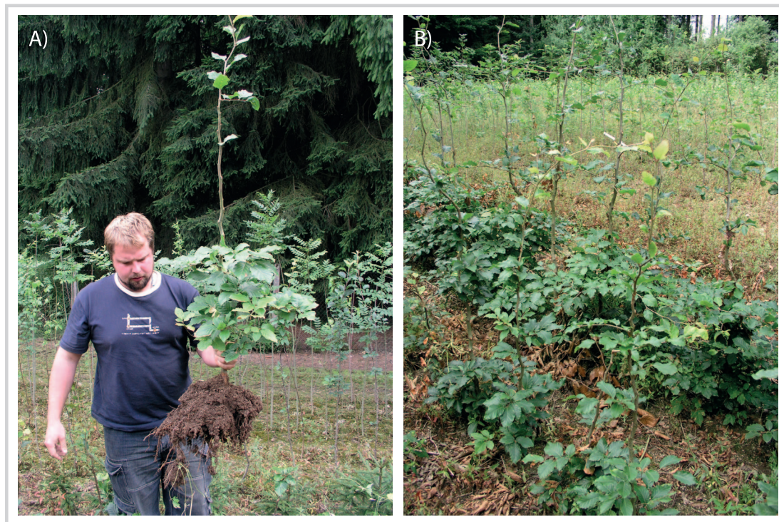
FIGURE 4 Bare-rooted saplings (depicted European beech) used in the diversification project to complement the common-sized planting stock. The fibrous root systems of the saplings are concentrated under the stem. The aboveground parts of the saplings are formatively pruned to reduce the growth and occurrence of coarse lateral branches.

and, eventually, also the soil chemistry at the diversified sites. The nutritional status was assessed on the basis of foliar analyses (Kuneš et al 2011). If N was needed to expedite the initial growth of plantations (apart from soil bases and P), it was applied as the condensation products of urea and formaldehyde (Jahns et al 1999, 2003; Jahns and Kaltwasser 2000) to avoid increased nitrification activity in the soil (Aarnio and Martikainen 1995).