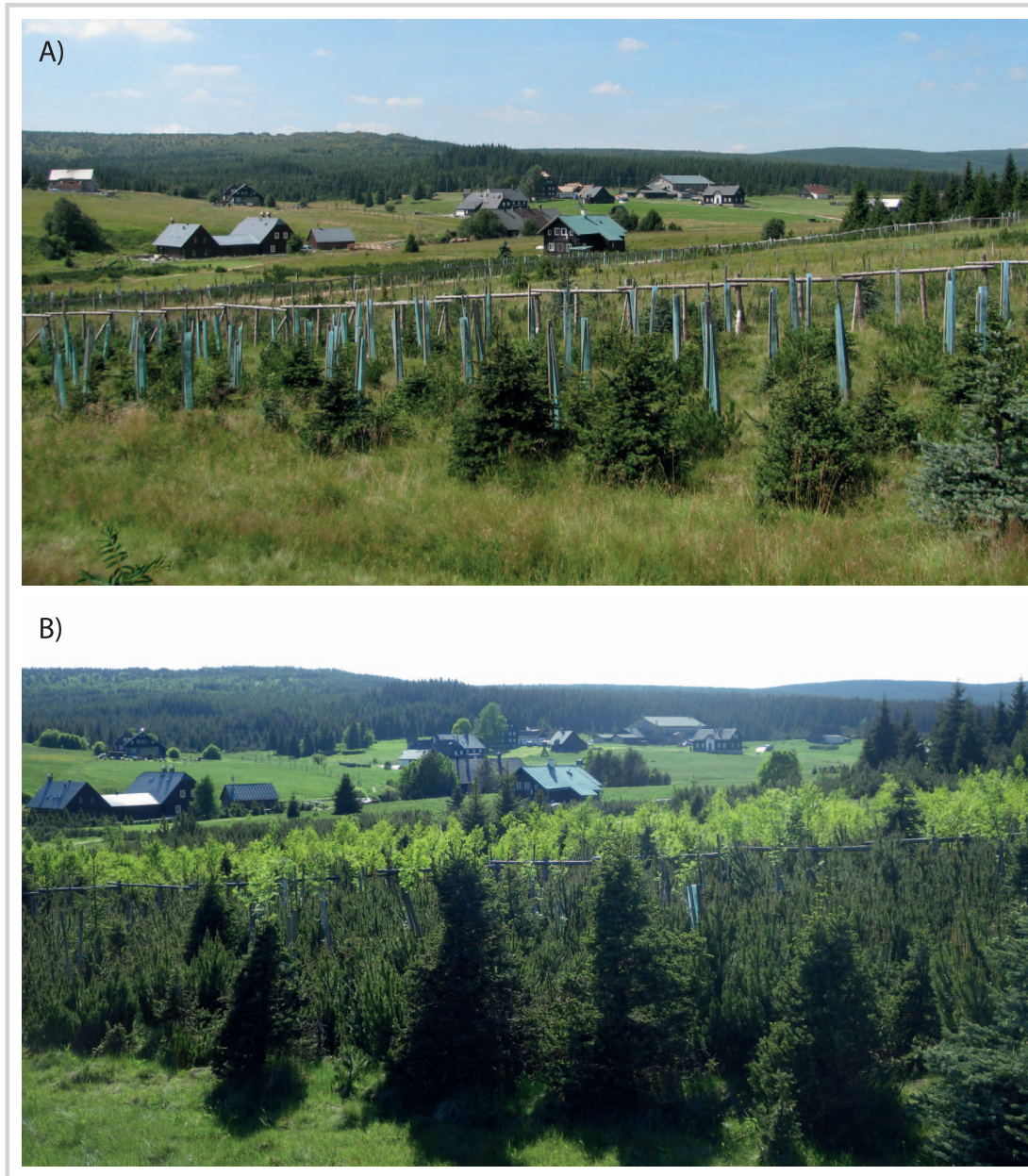
FIGURE 5 Diversification center (GPS: N 50°49.15022', E 15°21.12077') situated in a frost pocket close to the Jizerka settlement on the upper plateau of the Jizera Mountains. (A) A newly established center in the summer of 2009; (B) 7 years later with plantation of Carpathian birch ( Betula carpatica ), see the light-green crowns in the background, introduced to an older stand of Norway spruce ( Picea abies ), dwarf pine ( Pinus mugo ), and blue spruce ( Picea pungens ).

capreolus L.) and/or hares ( Lepus europaeus Pallas). In the outer zones (ie outside of the fenced exclosures), protection was provided by plastic tube shelters (Figures 2, 5) or tree guards (Figure S4, Supplemental material , https://doi.org/10.1659/MRD-JOURNAL-D-19-00059.1.S1 ). The plastic shelters must be at least 170 cm tall. Recently, we have used seamless, twin-walled tube shelters that are 180 cm tall. Fencing must be robust to resist the deformation forces of snow cover and rime. It should be approximately 170–190 cm tall to be red-deer safe (Figure S9, Supplemental material , https://doi.org/10.1659/MRD-JOURNAL-D-19-00059.1.S1 ).