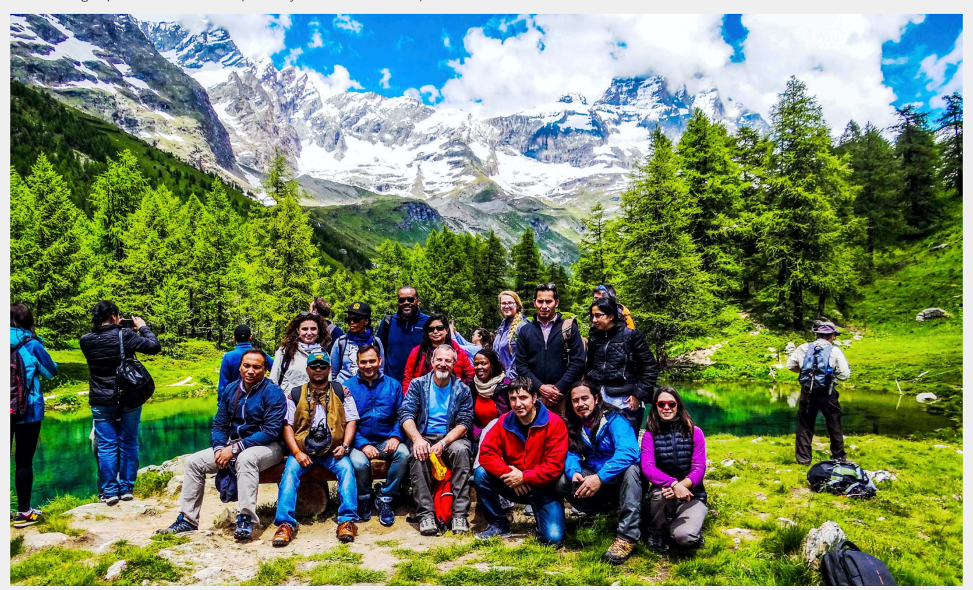
(Figure 3). The 2019 course was dedicated to the landscape approach for enhancing mountain resilience.