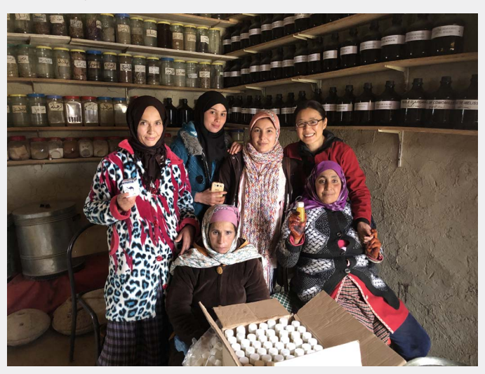
FIGURE 1 Medicinal plants: part of the Morocco Participatory and Integrated Watershed Management project's alternative livelihoods initiative.

management plans; at the community level, it linked local cooperatives to services, suppliers, and other agents to support their income generation (Figure 1). The project has also mainstreamed risk management into integrated watershed management from risk assessment, planning, design, and implementation.