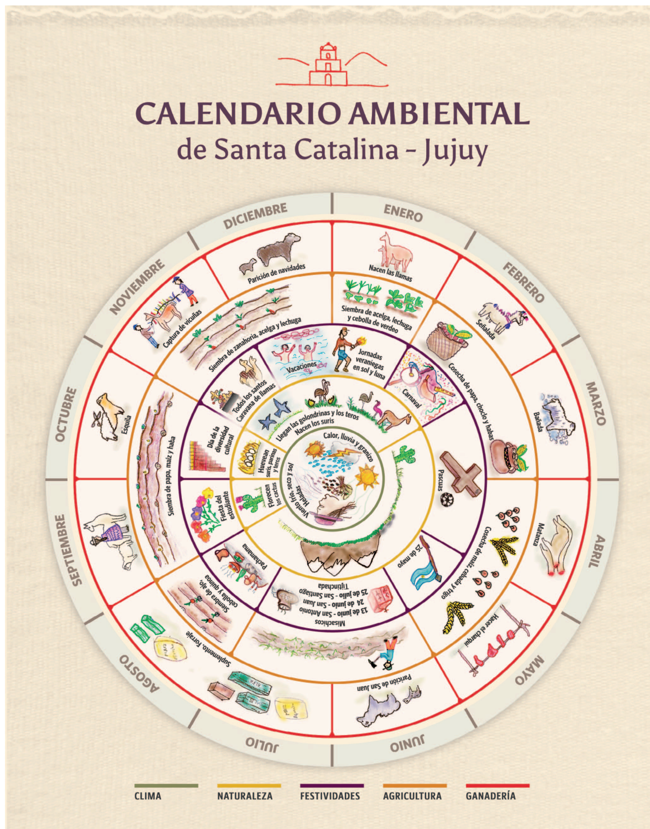
FIGURE 5 Participatory calendar produced at Vicuñas, Camélidos y Ambiente's environmental calendar workshop in April 2016. The calendar classifies activities and events into 5 categories, 1 in each ring. These rings are (from the center) climate, nature, local festivities, agronomic activities, and livestock management. Each slice represents a month of the year, from January ( enero ) to December ( diciembre ).