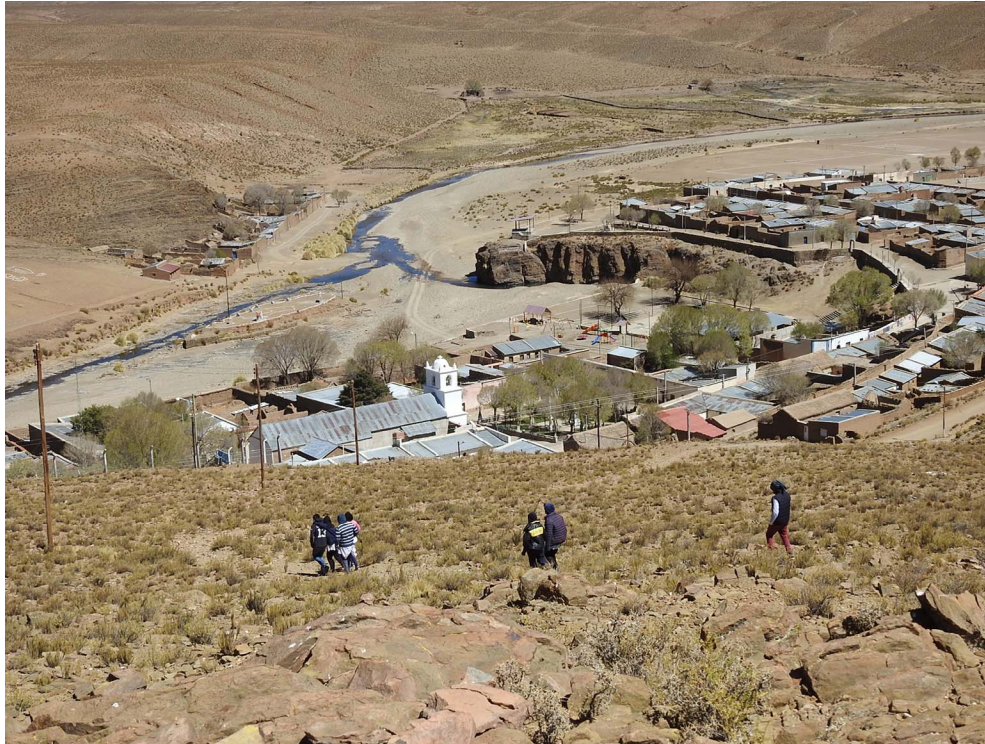
FIGURE 2 Santa Catalina school children coming back from the mountain to the town.

activity. We also proposed the creation of some form of lasting record, a material reminder of this shared experience, to which end participants were invited to engage in creative writing and drawing activities. All the exchanges and the children's productions were in Spanish.