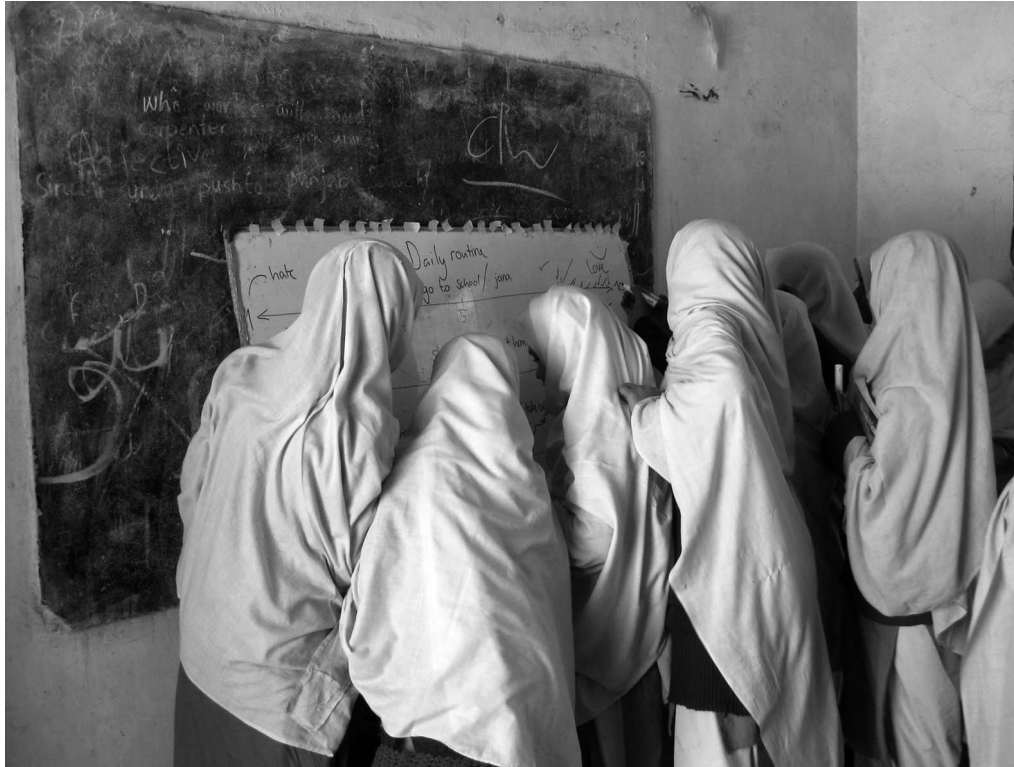
FIGURE 2 Workshop with students at a girls' school in Minapin, Nagar District, 7 April 2015.

workshops with (mainly female) teenage students (see Figure 2) and participatory observations during community meetings, invitations to households, and discussions in schools. These observations could not always be noted down directly but were protocolled afterwards. The majority of interviews were conducted with the help of female research assistants (local teachers), who facilitated access to interview partners and interpreted between the local languages, Burushaski and Shina, and English. In around half of the interviews ( Supplemental material , Appendix S1: https://doi.org/10.1659/MRD-JOURNAL-D-20-00028.1.S1 ), the main language was English and the first author communicated directly with the interview partners. During the interviews, notes were taken and, with the consent of the interview partners, some interviews were recorded and transcribed later. After each session, a short review of the interview notes was carried out with the research assistant to check for gaps and misunderstandings. One interview with a male informant was conducted jointly with the second author. As a female and foreign researcher, the first author did not experience cultural restrictions on conducting interviews with women and men. On most occasions, an open and trustful atmosphere could be created during the interviews, which was also because the research assistants were known to the interview partners and belonged to the same community.