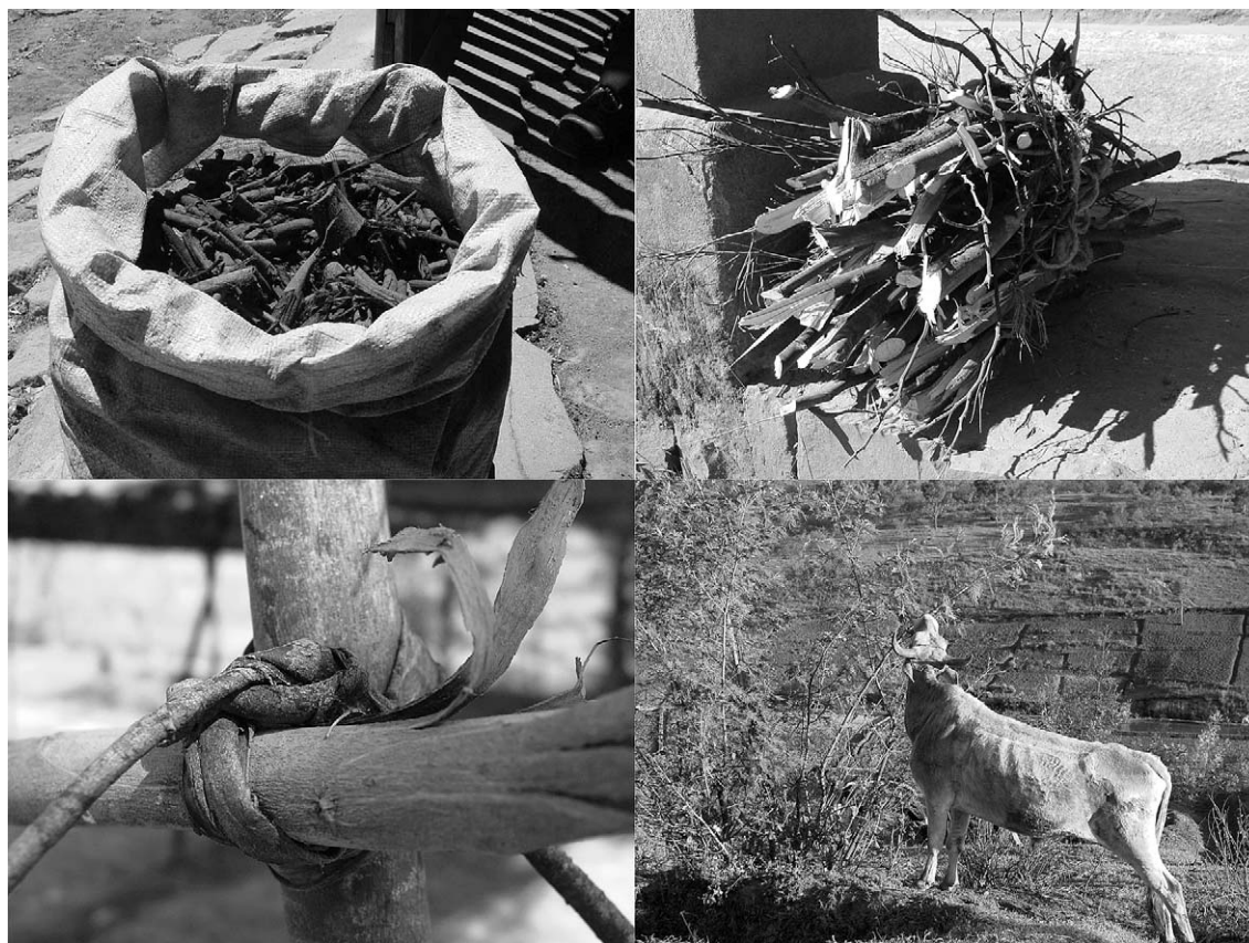
FIGURE 3 Uses of wattles. Clockwise: a sack of tanbark; a firewood bundle; use of leaves as cattle forage; use for posts and tying.

1971; de Neergaard et al 2005). As a result, wattles are self-reproducing multi-purpose shrubs utilized frequently by nearby farmers for a wide variety of purposes (Table 1; Figure 3).