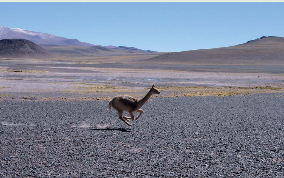
FIGURE 3 Vicuñas in the Argentinean Andes. Once an endangered species, the vicuña has seen its population increase rapidly during the last decades, coinciding with a decrease in rural population.

decrease in hunting and competition with domestic grazers is probably a more important factor (Figure 3).