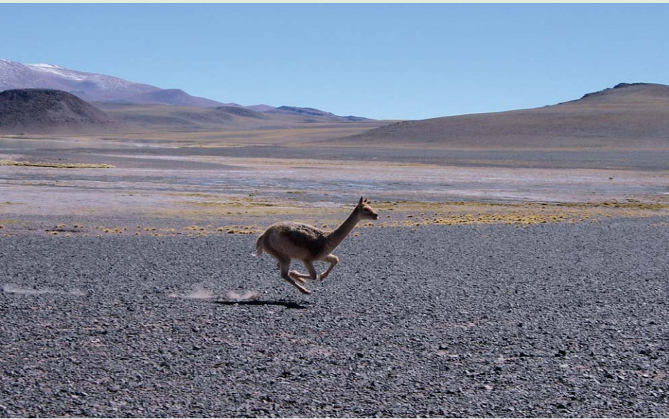
FIGURE 3 Vicuñas in the Argentinean Andes. Once an endangered species, the vicuña has seen its population increase rapidly during the last decades, coinciding with a decrease in rural population.

decrease in hunting and competition with domestic grazers is probably a more important factor (Figure 3).