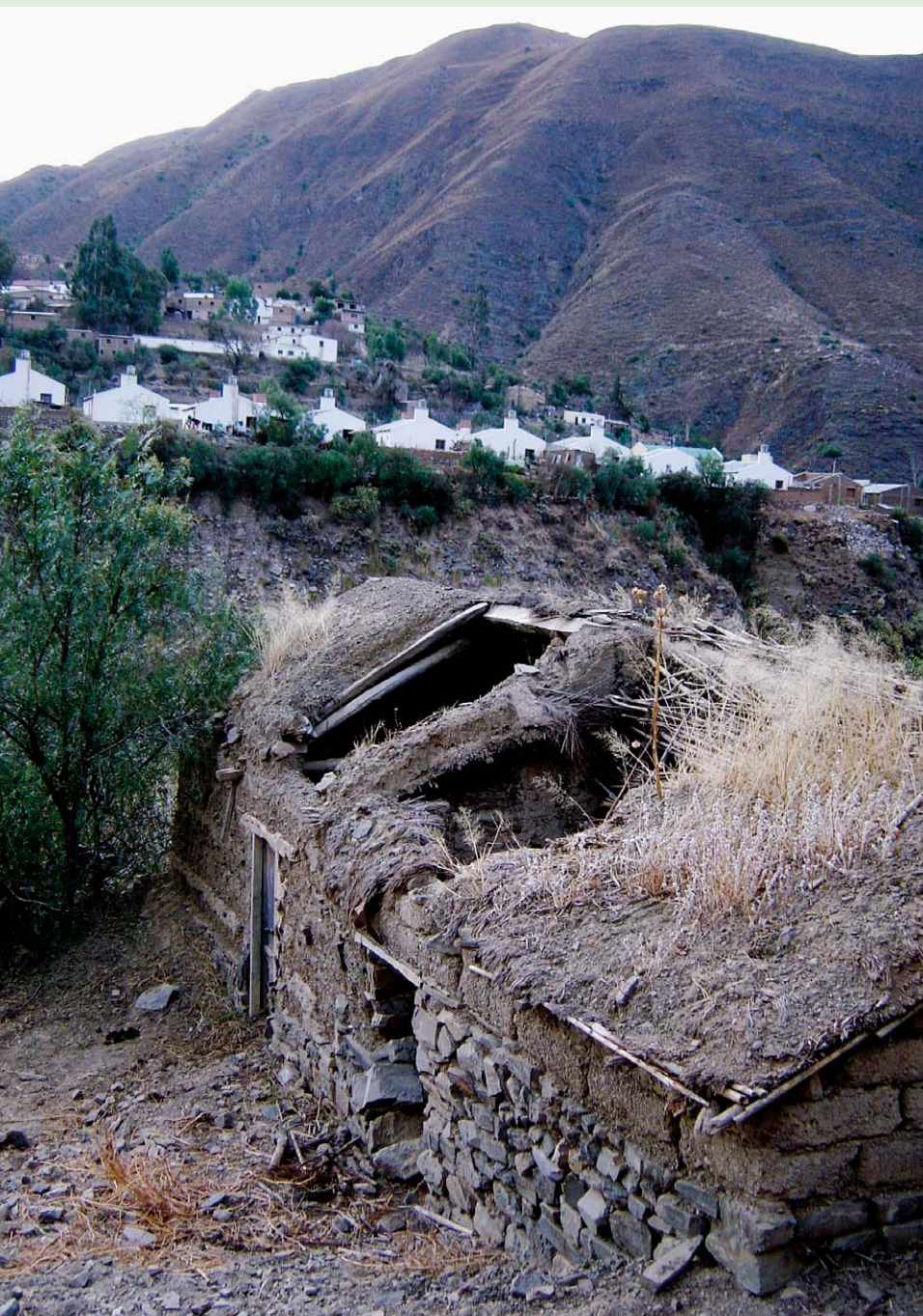
FIGURE 1 Housing trends reflecting population urbanization in local townships. Santa Victoria, northern Argentina.

cheaper than in rural areas, where people live at much lower densities in poorly accessible areas, as is often the case in mountains.