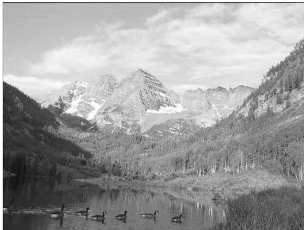
FIGURE 1 The Maroon Bells in the Elk Range near Aspen, CO, are a signature for the pristine alpine beauty of Colorado's Fourteeners.

study was performed by members of the Rocky Mountain Field Institute (RMFI) in the Sangre de Cristo Range of southern Colorado addressing the restoration efforts on Humboldt Peak (Hesse 2000). The information presented in the case of Humboldt Peak provided a good overall physical description of what is occurring on all of the Fourteeners. However, the study failed to directly address values indicating climber-visits to Humboldt Peak.