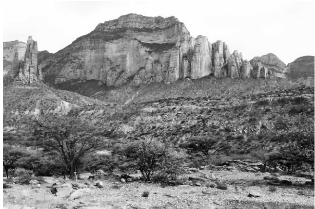
FIGURE 2 Partial view of Mount Kemer, from Da Tsimbia. The TDZ is located behind the ridge. Note the presence of small remnant forests on inaccessible flats.

communicate in Amharic, though most elder people also know Tigrinya. There are many cross-marriages, girls from Hidmo who marry at the other side of the river.” Quarrels over land use rights do not seem to have an ethnic flavor—they are rather similar to what may occur between neighboring villages within Tigray.