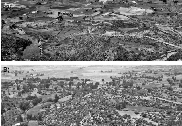
FIGURE 3 An area where livestock movements have been abandoned has undergone important changes between 1975 and 2007. The former grazing lands (lower part of the photographs) have been closed and livestock are fed on grass harvested from these exclosures. (A) Antshel in 1975.; (B) Antshel in 2007.

cases, transhumance leads to remote boundary areas between woredas , with low population densities. In the case of Hidmo, livestock are brought to another woreda in the dry season, which has less land suitable for agriculture and hence small landholdings, less population, and lower oxen densities.