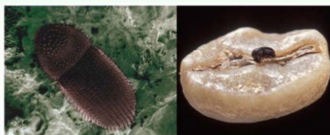
Figure 1. Dorsal view of an adult coffee berry borer, Hypothenemus hampei (left) and adult female (~ 2 mm long) walking over a coffee seed (right). High quality figures are available online.