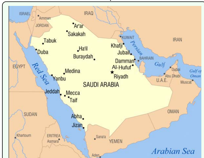
Figure 1. Map of Saudi Arabia showing Al-Hufu, the capital of Al-Ahsaa district. High quality figures are available online.