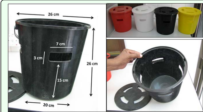
Figure 1. Red palm weevil trap dimensions (left), tested colors (upper right), and trap inside and lid (lower right). High quality figures are available online.

In the current study, the trap color was the color of the plastic material itself (original color), whereas in Al-Saoud et al. (2010), the traps were white and experimentally sprayed with different paints (painted color). A total of 48 traps were installed in four locations in the field. Each location was a date palm plantation in which four trap colors (white, yellow, red, and black) were tested. Each trap color was represented by three traps (replications) per location. Trap surface color values ( L^*a^*b ) were measured by a chromameter (Table 1). The L -value is the