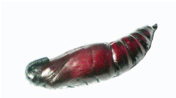
FIG. 6. Pupa of L. justiciae pupa from Itanhandu, Brazil (lateral view).

Fifth Instar (Brown Form): As with all other known Lintneria larval histories, there is a dramatic change in general form in the last instar. The mid-dorsal thoracic protuberance is replaced by a large hump with a large black patch on thoracic segments two and three which is encircled in bright lime-green. The ground color of the larva, head, true legs, prolegs, and anal horn are a dark brown and the entire larva is heavily stippled with very faint, light spots. The brown frontal lobes of the head have a pair of green vertical stripes. Each abdominal segment has a bright, lime-green triangular patch, the base of which transects the spiracle horizontally and runs the entire width of the segment. This lime-green patch is heavily stippled with dark brown spots. The black anal horn is stout, extremely rugose, and curves sharply downward. 79–80mm (n=2)