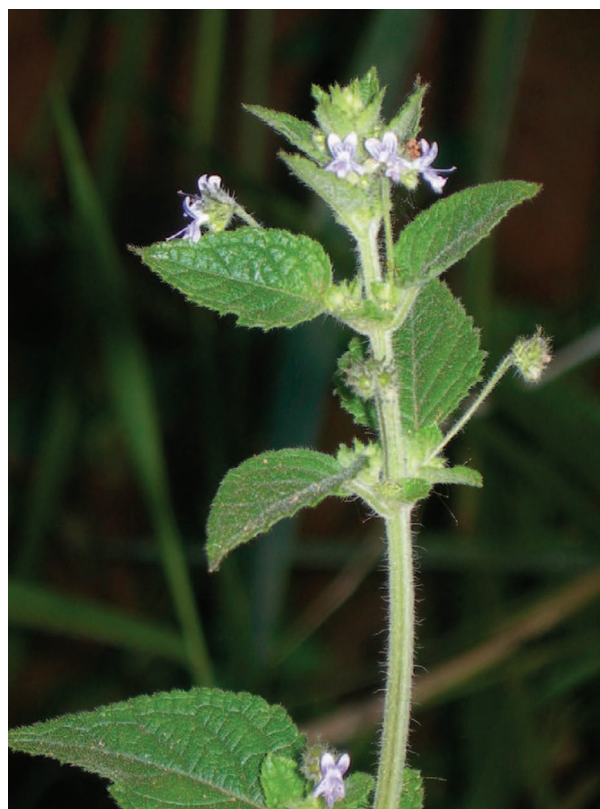
FIG. 7. Close-up of larval host plant, Hyptis sidifolia (Lamiaceae).

One of us (JPT), while carrying out investigation into the genus Sphinx for “The Hawk Moths of North America”, discovered a possible correlation between adult forewing pattern and larval morphology. The species with minimal or orderly linear forewing maculation patterns had a “typical” sphingid larval form throughout all five instars—long and cylindrical. In contrast, the species with intricate mosaic forewing maculation patterns had a larval form with a large, fleshy mid-dorsal protuberance on the second thoracic segment in instars 1–4 (as described in 3rd instar above) which is replaced by a thoracic hump in the last instar (as described in 5th instar above).