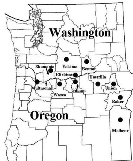
FIG. 3. Counties of the states of Oregon and Washington positive for collection of Hecatera dysodea .

In 2009, from 9 July to 20 August, 99 Lepidoptera larvae were collected from flower stalks of prickly lettuce plants at eight sites in four counties in the state of Washington (Table 2). Seventy-two H. dysodea adult moths emerged from these samples from 28 July to 9 October 2009. Although some larvae died while