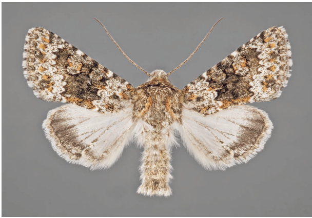
FIG. 1. Adult male moth of Hecatera dysodea reared from larva collected on Lactuca serriola in Dufur, Oregon.