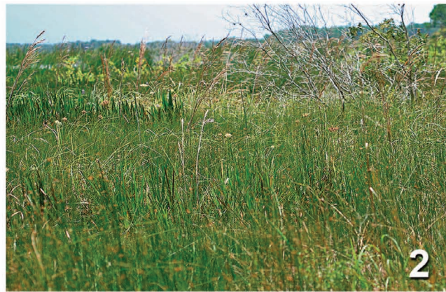
FIGS. 1-2. Didasys belae (Orange County, FL). (1) Adult male. (2) Habitat.