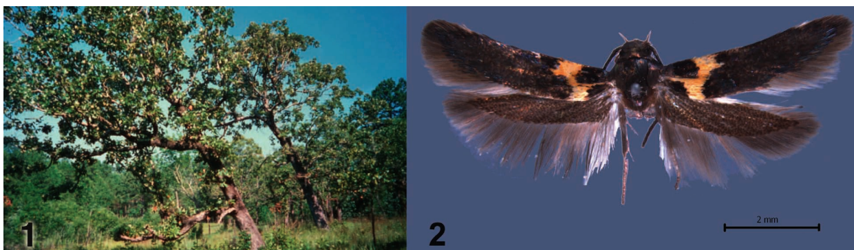
Fig. 1. Type locality of Euclemensia barksdaleella n. sp. Lee and Brown at Barksdale A.F.B., with Quercus stellata and in foreground. Fig. 2. Adult photo of Euclemensia barksdaleella n. sp. Lee and Brown. Scale bar: 2 mm.

Larvae of both E. bassettella and E. schwarziella are parasitoids of scale insects, specifically Kermes spp. and Allokermes kingii (Cockerell) (Hemiptera: Kermesidae)